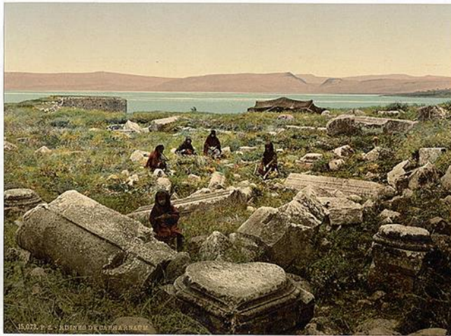
Fig. 2: Unknown tourist photographer, Mount of Beatitudes: Ruins of Capernaum, ca. 1890-1900.

Figure 2 presents a tourist photograph in the archeological ruin of Capernaum. The people appear small, distant, static, and dark, indiscernible as individuals, which highlights the sparseness of the surroundings; they do not obstruct or disrupt the landscape. The archeological ruins in the background serve as an artistic backdrop. The integration of the aesthetics of antiquarianism and the aesthetics of archeology became a developing practice of tourist Orientalist photography. This image is a hybrid of landscape photography and archeology that bridges archeological documentation and tourist photography in Palestine in style and essence, of viewing remnants of a glorious past in decay. Once again, the diminished size of the people subjugates them in the eyes of the viewers. The hand-tinted colors resonate of a painterly style of landscape painting.