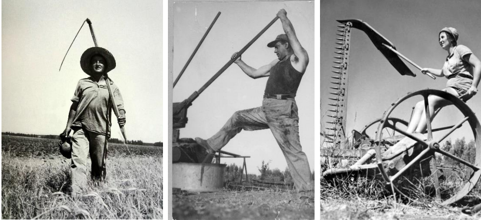
Fig. 4, 5, 6: Zoltan Kluger, 1934–40. Courtesy of the Government Press Office and the KKL-JNF Photo Archive

The smiling pioneer's brisk walk in Figure 4 complements the scythe held up high, as well as his large size and physical prowess. The muscular activity of the worker in Figure 5 is emphasized by the diagonal lines of the machinery; his thrusting arms dominate the frame. Figure 6 shows a woman on a tractor on a kibbutz (images of gender equality, deriving from their socialist lifestyle and ideology were prevalent). Figure 6 was taken from a low angle, empowering the woman. The frame is filled with the machine she is employing, creating a dynamic between her actions and symbols of modernity and technology. Kluger positioned the workers in all three photographs in the center of the frame. The trampled landscape becomes immersed with physical and technological intervention; it no longer exists in its own right, but rather as a platform for Zionism.