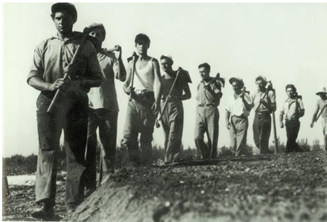
Fig. 3: Zlotan Kluger. Kibbutz Ma'ale Ha'ha'misha, 1938. Courtesy of the KKL-JNF Photo Archive

Figure 3 presents a group of pioneers marching briskly, swinging their shovels and picks upright on their backs. The low angle suggests power, the tools allude to weapons; their determination resembles military marches. Faster cameras and high-speed film allowed spontaneity and photography in action. The use of extreme angles and dynamic composition in the context of the working class derives from the style of Soviet photography in which the worker is visually enhanced by the strength of the masses (Barromi-Perlman, 2015). Kluger's organized frames, low angles, high contrast, and images crisscrossing the frame were also influenced by the European style of New Objectivity (Oren & Raz, 2008). The worker in