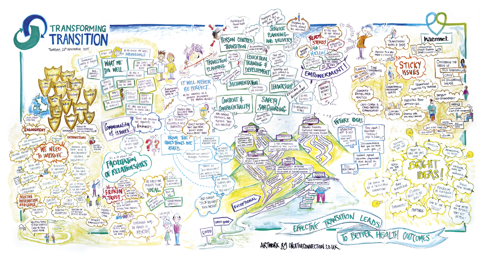
Figure 2: Views expressed in the workshops were captured graphically