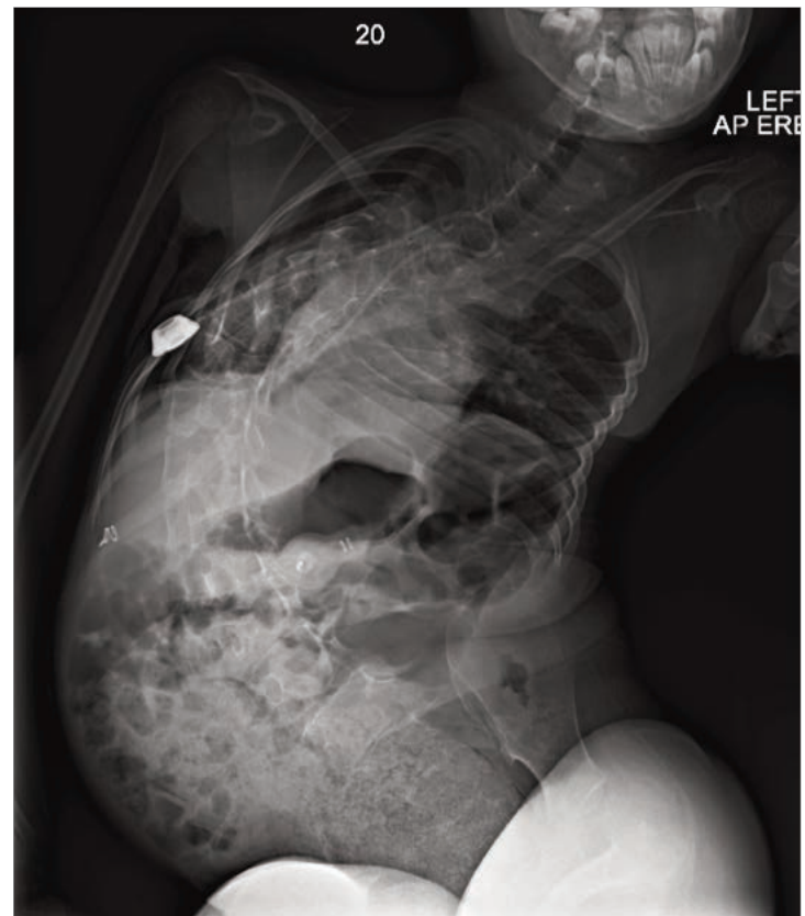
Figure 2: Complications including significant scoliosis complicated positioning for peripheral treatment

Venous access was required to facilitate prophylactic therapy with PCC; a central venous access device