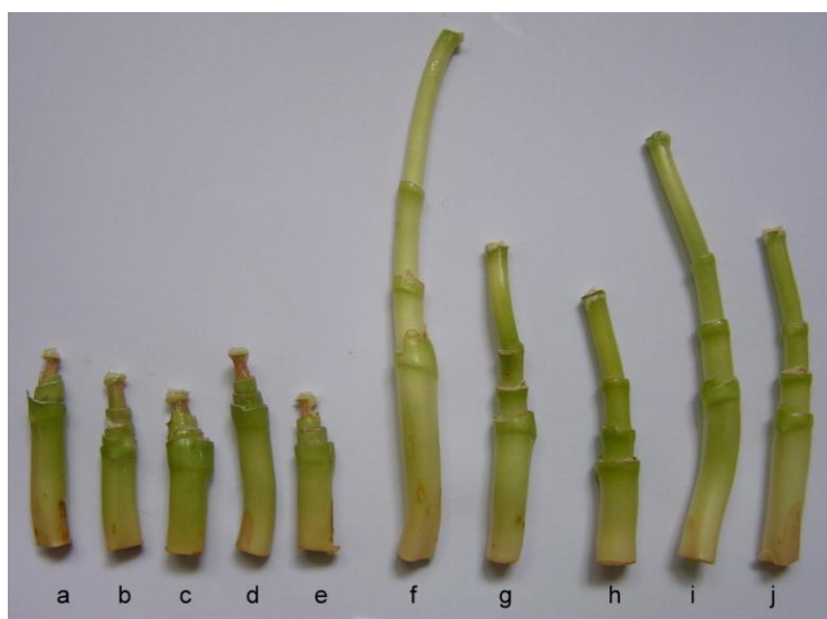
Figure 2. The effect of mannitol and sorbitol on the growth of tulip stem isolated from growing tulips and induced by IAA. IAA was applied in the place of removed flower bud and explants were kept in water (control) or solution of mannitol or sorbitol (photographed on February 25):