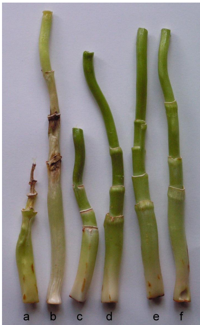
Figure 1. Interaction of IAA and sucrose on the elongation of stems excised from growing tulips and the chlorophyll content. IAA was applied in the place of removed flower bud and the explants were kept in water (control) or sucrose at different concentrations (photographed on March 25):