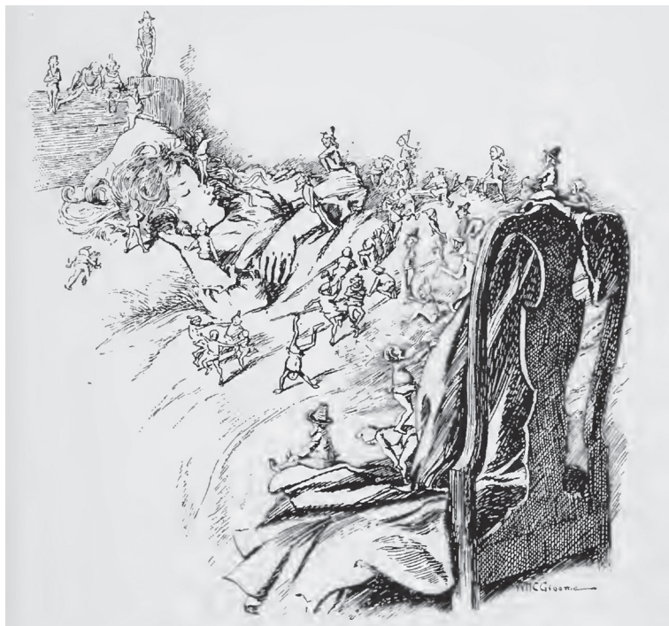
Figure 2. The pixies try to order Phillida's dreams (Tregarthen 1906: 91).

garthen stories have, for anyone accustomed to Nellie Cornwall's prose, a jarring lack of references to Christianity. (For a moving exception, see Tregarthen 1906: 98, where the pixies try to order Phillida's dreams on Christmas Eve: "Somebody far greater than we little Piskeys is ordering Phillida's dreams [...] which are much more beautiful than we