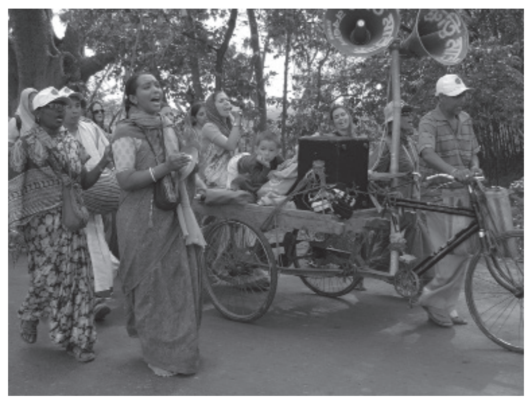
Photo 2. Devotees singing the holy names of God on Parikrama (pilgrimage) in Mayapur.

meditation, which means at least 16 rounds of individual chanting of the Hare Krishna mantra using prayer beads. According to the scriptures, the God's activities, called lilas , are eternal and thus devotees claim that actually Lord Chaitanya still walks the fields in Mayapur and takes a bath in the Ganges. Devotees believe that those who have purified their consciousness through kirtan and japa can 'uncover' Mayapur and still perceive the presence and mercy of the Lord. This perception enables them to create a very intimate relationship with Krishna – with God who is simultaneously residing in his eternal spiritual sky as well as in Mayapur as Lord Chaitanya.