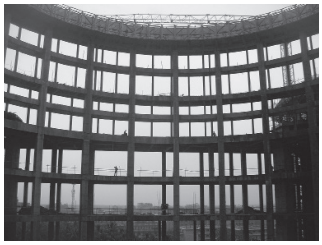
Photo 1. Temple of the Vedic Planetarium under construction.

of knocking and sawing metal becomes a disturbing cacophony, creating the holistic sensational experience that your own body is under construction. As the sound artist Salome Voegelin (2010: 47) has written, "The body of the sound has moved so close it is my body: I am the host of noise" (original emphasis). However, I was told that it was up to the devotees and depended on their consciousness whether they would perceive those sounds as destructive construction sounds or a pleasing kirtan of a city that was growing for the Lord and his devotees.