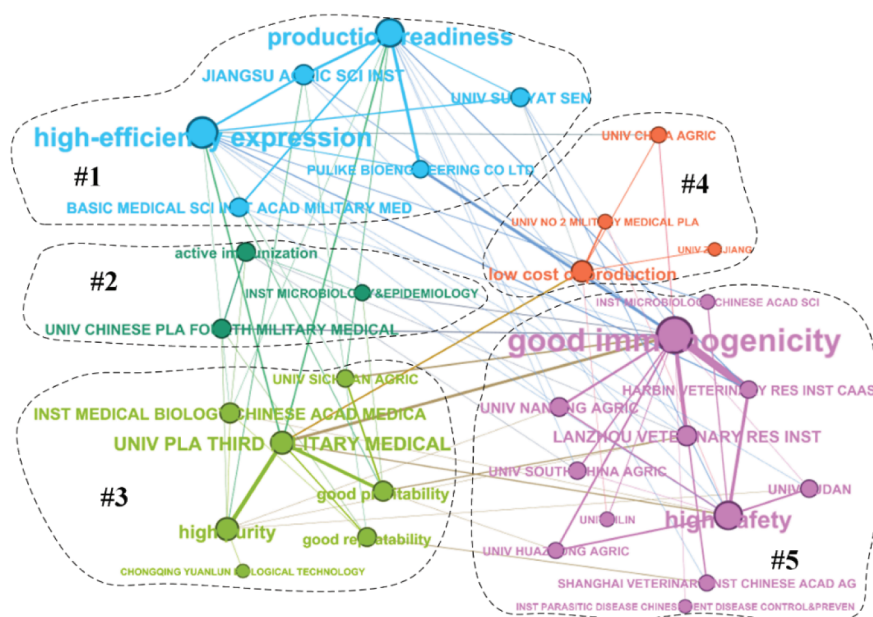
Figure 3. Two mode network of GEV patent applications and technology-effect.

To achieve the commercialization of the GEV, all the nine technology-effect factors need to be well developed. There are interdependencies among the agencies in five communities, that is, similarities in technology-effect. Therefore, these patent application agencies have the basis for cooperation with each other.