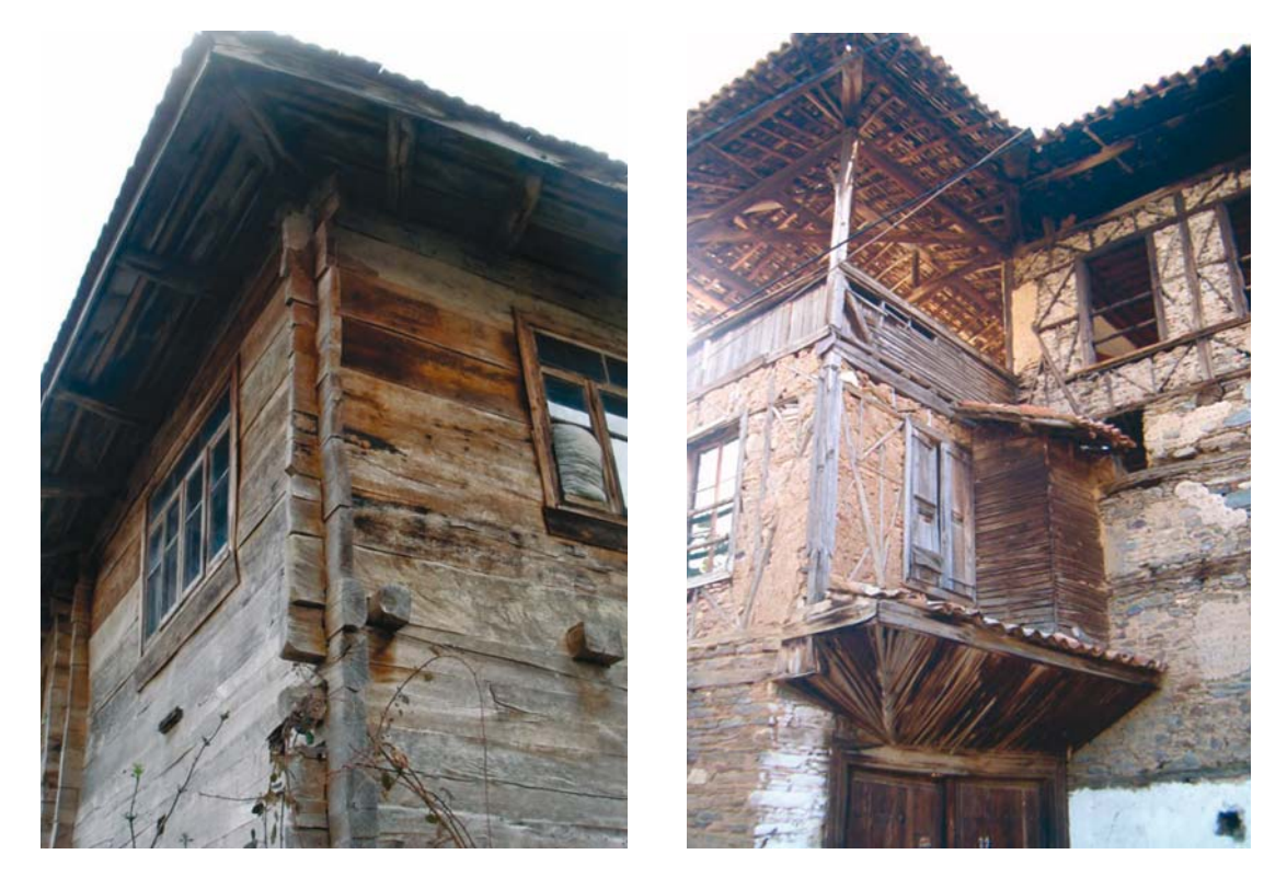
Fig. 3. Log House from Zonguldak, , Gökçebey, Herkime (North Anatolia)(web 1), Timber Framed House from Birgi (Western Anatolia)

Timber frame system that rises over the ground floor walls generally made with stone, composes the first floor (sometimes second or third depending on the size of the house) and mostly the main living rooms of traditional Turkish house for the reasons like climate factors, protecting timber from humidity, increasing fire resistance and in the context of regional material resources and the effects of traditional life style (for example intimacy requirements). Besides the frame system, it is seen that timber construction elements are used in masonry walls and horizontal construction components like beam and lintel have significant functions against the earthquake loads [1].