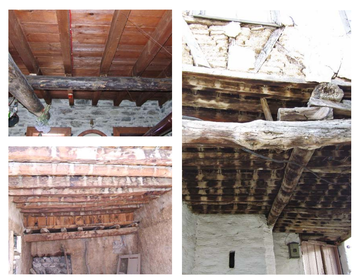
Fig. 8. Floor Constructions of Houses Birgi (left up), Kula (left down) and Bayindir (right)

Another important elements of the first floor are the projections, which are iconic elements of the facades as well. There are numerous examples of projections and they can be different in terms of form, material use and/or construction techniques.