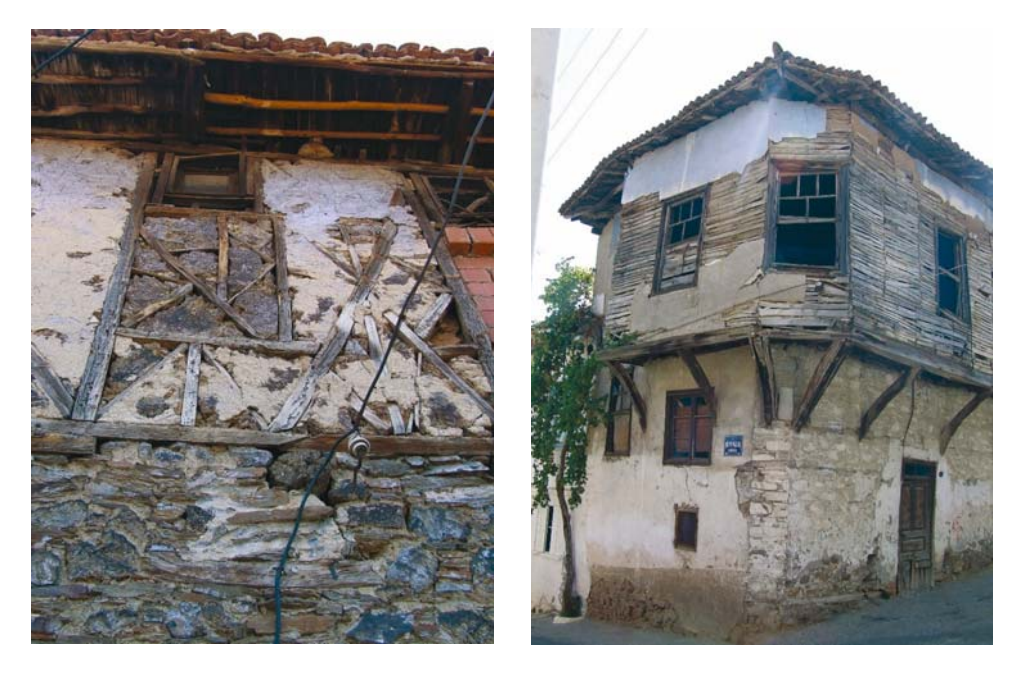
Fig. 6. Himis Technique (Kula) and Bagdadi technique (Bayindir) (right)

Upper floor is constructed with timber frame infilled with a technique called as "himis" and plastered or/and covered with small sectioned timber laths and plastered called as "Bagdadi" in Turkey. Himis is a typical timber frame structure in which small pieces of row materials (brick, stone, adobe, etc...) are used as infilling material. And bagdadi is a simply lath and plaster technique where the voids between timber framing members are sometimes filled with lighter materials;the surfaces of the walls are covered by lath and plaster work [6].