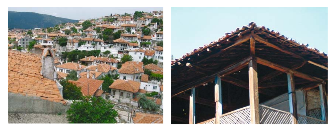
Fig. 10. Roof typology of Muğla settlement (left), Roof construction of a Birgi House (right)

One of the main criteria that affected the traditional construction technology in the region were the earthquakes. From seismic design point of view, the diagonal members are the most important elements of the structure. To provide the overall ductility of the system and energy absorption capacity, the braces should be properly constructed. The lack of these elements in the frame parallel to the main earthquake direction causes partial or total collapse of the structure [7]. Another important issue emphasized in the study by A. Er Akan is the loss of the techniques used in the traditional timber structures. But it is concluded that there are still several characteristics of these structures some of which can offer the key for new earthquake resisting structure. Therefore, for designing a structure in earthquake zone architects should be aware of the dynamics of the seismic behaviour. According to researchers earthquakes have shaped the traditional timber structures in the past. Therefore, people can learn many things from the traditional construction techniques."