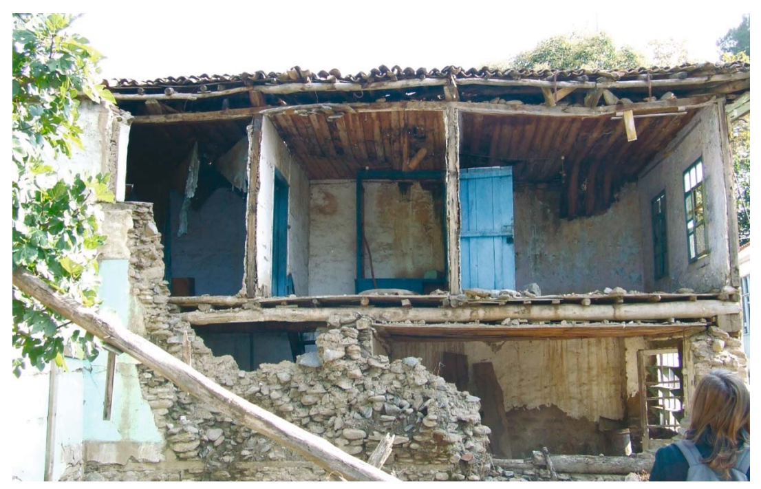
Fig. 7. "Section" of a Traditional Turkish House from Birgi

Before the construction of the upper floor, the timber wall plates are placed on the inner and outer edges of the ground floor main walls. Also, free-standing posts placed in the semi-open circulation spaces known as "taslik" are connected horizontally to the main beams, forming a base for the upper floors. On the upper floors, posts (studs) and secondary posts are placed on a timber beam which is called as the sole plate (usually 12/12cm a square section element) as a base on the masonry wall. Usually with a dimension of 10/12 or 12/12cm posts are usuallymade of yellow pine tree are installed at approx. 1 meter distance-between each other on the sole plate. These posts are supported by secondary diagonal timber elements (braces)-of 8/8 cm. In cases of needing openings such as windows or doors, secondary posts are used to obtain the necessary space for the opening. Two secondary timber beams, one at the bottom of the opening and one at the top of the opening (lintel) are used to obtain door or window openings on the surface of the wall. These beams are connected to the main posts with nails. Usually the walls are filled with stone to form the surface.