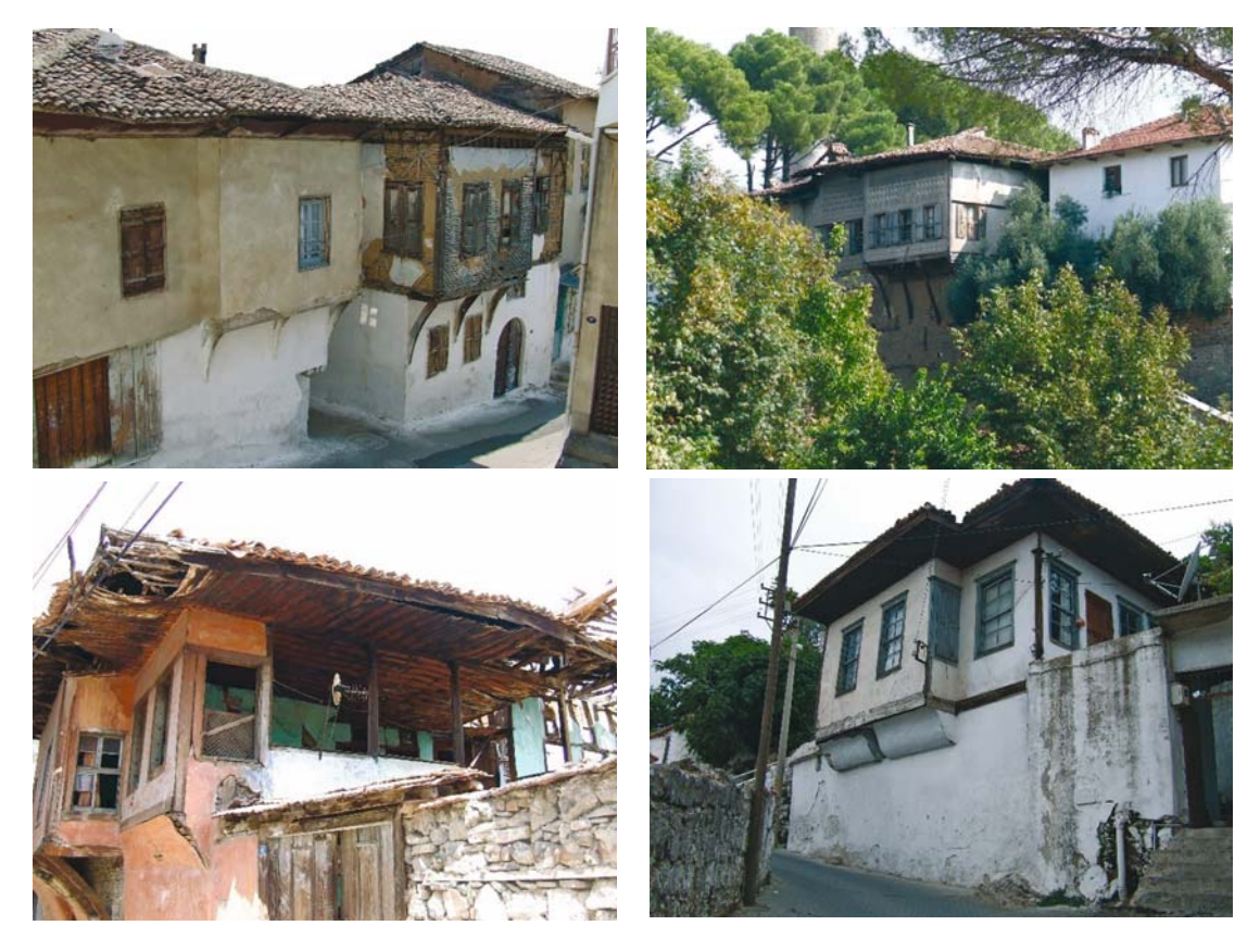
Fig. 9. Different projection types from Bayindir (left up), Kula (Left Down), Birgi (Right Up), Muğla (Right Down)

To build projection (cikma in Turkish) on the upper floor, the load-bearing elements that carry the projection are constructed according to the type and extension of the projection and put in place at this stage. Main beam(s) is extended and the floor beams placed on/ between them. And the timber cantilever beams are supported by diagonal bracing elements. Floor and roof systems are quite similar, while many types of projections can be seen among the settlements.