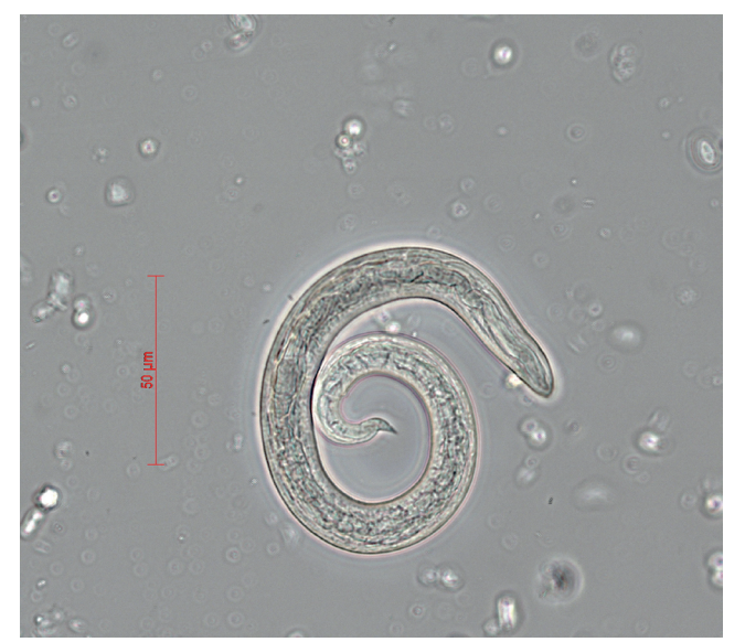
Fig.6. Larva of Crenosoma striatum in hedgehog, stage L1.

Sarcocystis sp. in 9 samples (0.7 % IP), Cryptosporidium sp. in 15 samples (1.1 % IP), and Thrichomonadidae in 30 samples (2.3 % IP).