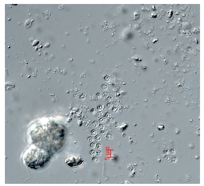
Fig.4.Oocysts of Cryptosporidium sp. in ferret.

The animal study was in compliance with all the 209 relevant national regulations and institutional policies relating to the care and use of animals in Russia.