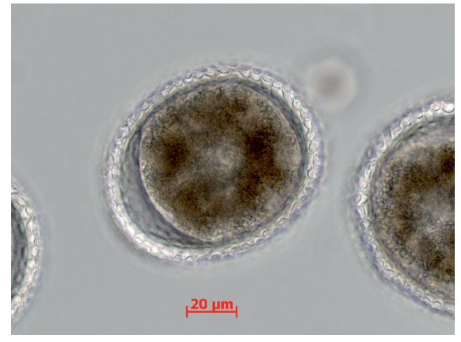
Fig.1. Eggs of Toxocara canis in dog.

al. , 2013; Shcheveleva et al. , 2016). Due to the biological features of some parasitic diseases, the risk of direct infection from infected animal to human is very low, because some helminth or protozoan