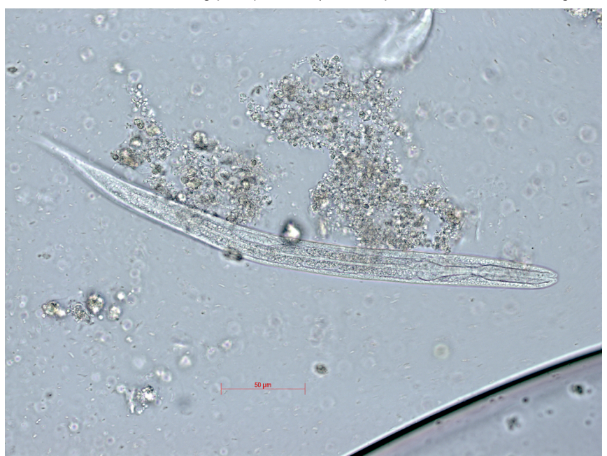
Fig.2. Larva of Strongyloides sp. in dog, stage L1.

introduced into the environment while already primed for infestation and can be transmitted to humans under certain conditions (dwarf tapeworms, enterobiasis, giardiosis, cryptosporidiosis,