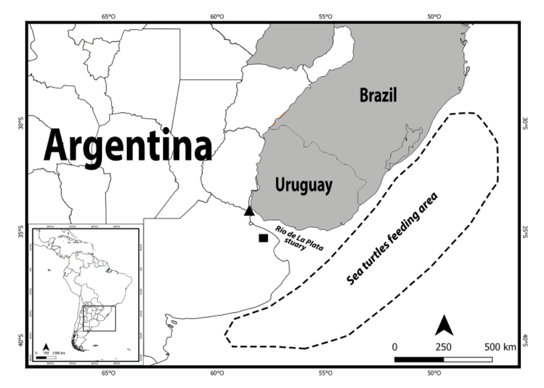
Fig. 3. South America map showing the new record of Amphiorchis sp. (black square), the record of Dermochelys coriacea within the estuary of the Rio de la Plata (black triangle), the estuary of the Rio de la Plata, and the feeding area of the marine turtles.