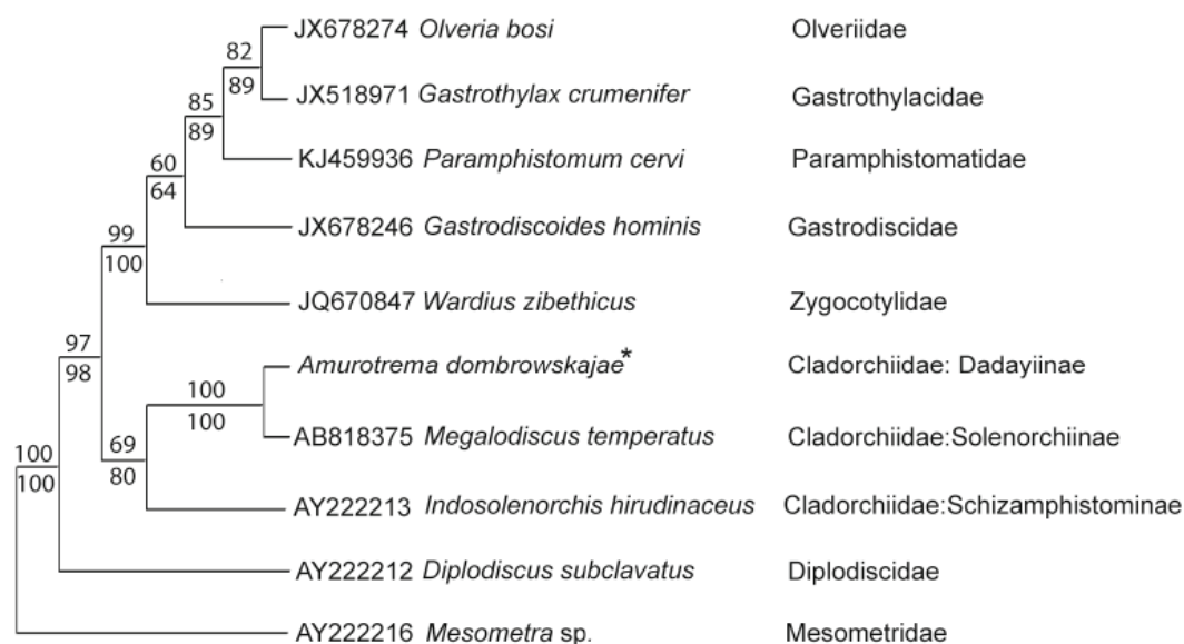
Fig. 2. Relationships between Amurotrema dombrowskajae and related taxa based on Maximum Likelihood analyses and Bayesian inference of the 28S rDNA dataset. Bootstrap support values are shown above the nodes and posterior probabilities below the nodes. Sequence obtained in the present study is indicated by asterisk (*). Mesometra sp. is the outgroup taxon.

and Dadaytrematinae to be synonyms. Sey (1988) adhered to a similar opinion, but incorrectly recognized the validity of Dadaytrematinae (Jones, 2005).