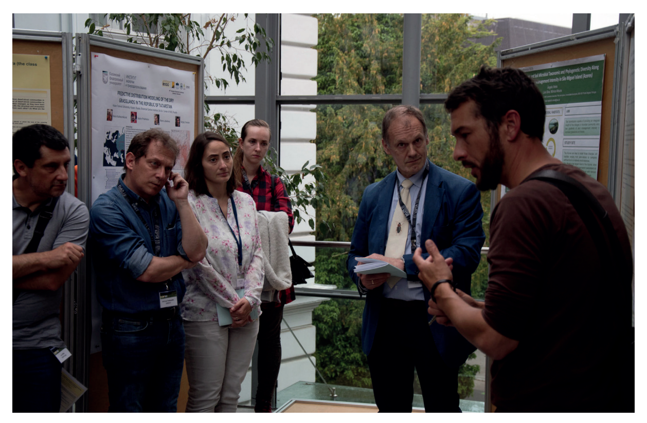
Figure 1b: Impressions from 16<sup>th</sup> Eurasian Grassland Conference in Graz, Austria. Slika 1b: Vtisi z 16. Evrazijske konference o traviščih v Gradcu v Avstriji.

The 11th EDGG Field Workshop was held in the Eastern Alps, Austria from 6th to 13th July 2018, with Martin Magnes, Philipp Kirschner and Helmut Mayrhofer as the local organizers (Magnes et al. 2018; Figure 1c). The field workshop was attended by 18 participants from 10 countries and 15 nested-plot series and 37 additional normal plots were sampled. The 12th Field Workshop also targeted the inner-alpine valleys but in Switzerland, organised by Jürgen Dengler and his co-workers (11-19 May, 2019; Dengler et al. 2019, Figure 1d). This field workshop was attended by 16 participants from 5 countries. During the field workshop, 30 nested-plot series and 81 additional normal plots were sampled. The 13th Field Workshop: "Grasslands of Armenia along an elevational gradient" was held between 26 June -7 July 2019 in Armenia, organised by Alla Aleksanyan. Further details will be included in the next report, as this field workshop was still in progress at the time of the submission of this manuscript.