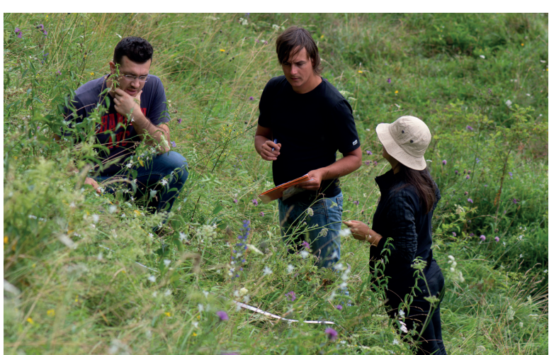
Figure 1d: Impressions from 12<sup>th</sup> Field workshop in the inner-alpine valleys, Switzerland. Slika 1d: Vtisi z 12. EDGG terenske delavnice v notranjih alpskih dolinah v Švici

Slika 1c: Vtisi z 11. EDGG terenske delavnice v vzhodnih Alpah v Avstriji.