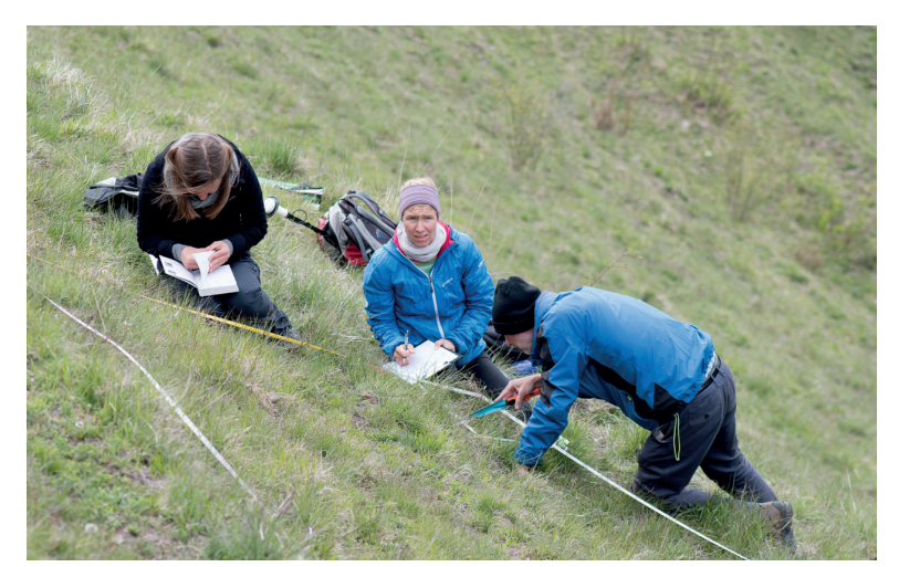
Figure 1c: Impressions from 11<sup>th</sup> EDGG Field Workshop in the Eastern Alps, Austria.

Slika 1c: Vtisi z 11. EDGG terenske delavnice v vzhodnih Alpah v Avstriji.