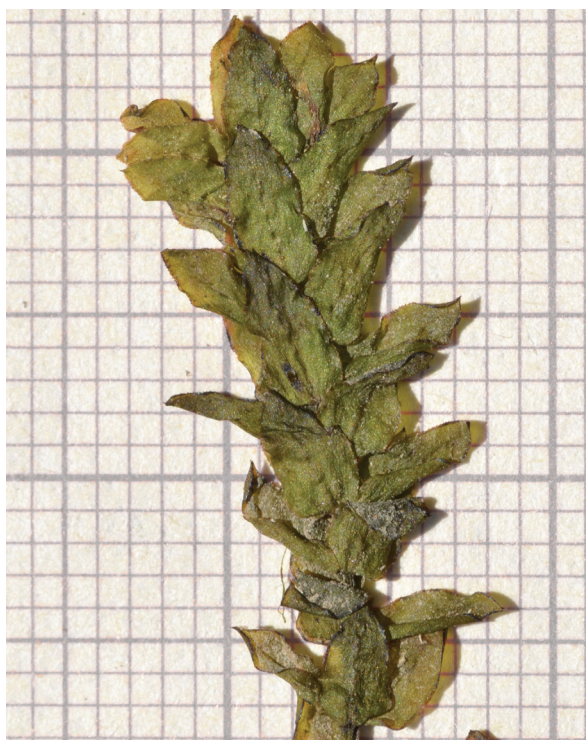
Figure 2: Stem with leaves (Left) and upper leaves (Right).

Slika 2: Steblo z listi (levo) in zgornji listi (desno).