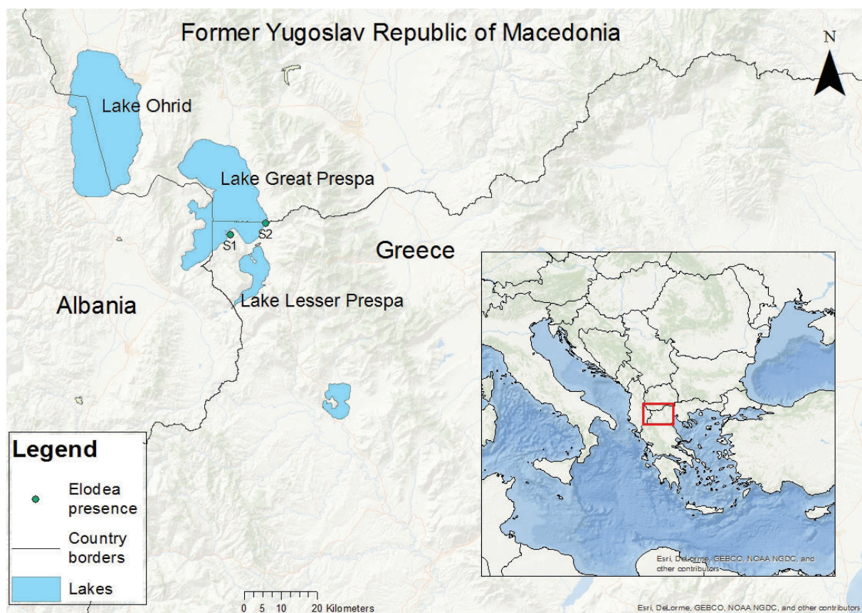
Figure 1: Map of the lakes Great Prespa, Lesser Prespa and Ohrid.

The first indication of the species’ presence in lake Great Prespa was during water sampling for the implementation of the Water Framework Directive (WFD) 2000/60/EC (EC 2000) in Greek lakes, in September of 2014. Floating stem fragments were collected in the little harbor of the village Psarades (site S1), in the southern part of the lake. Although the fragments could be assigned to E. canadensis , the lack of rooted specimens prevented us from