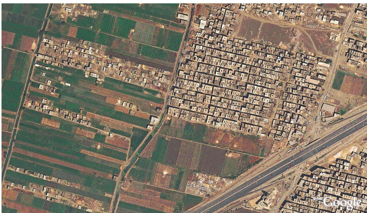
Fig. 4 – Older urban sprawling upon agriculture lands in the north of Greater Cairo Region (GCR) abutting the ring road.