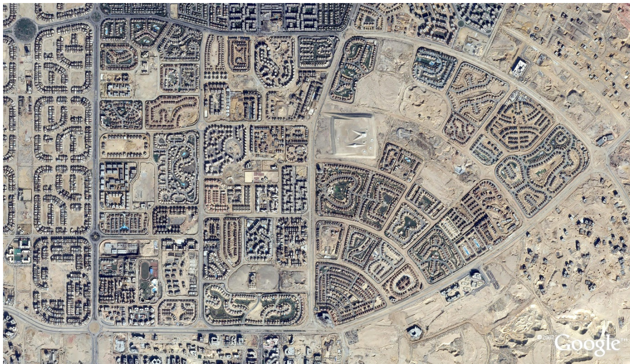
Fig. 5 – Gated communities in the desert city of New Cairo.