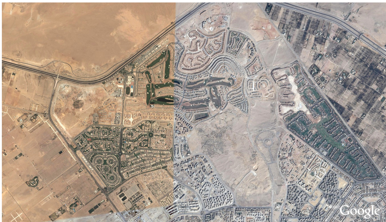
Fig. 6 – Gated communities and fragmented developments in the desert city of Sheikh Zayed.