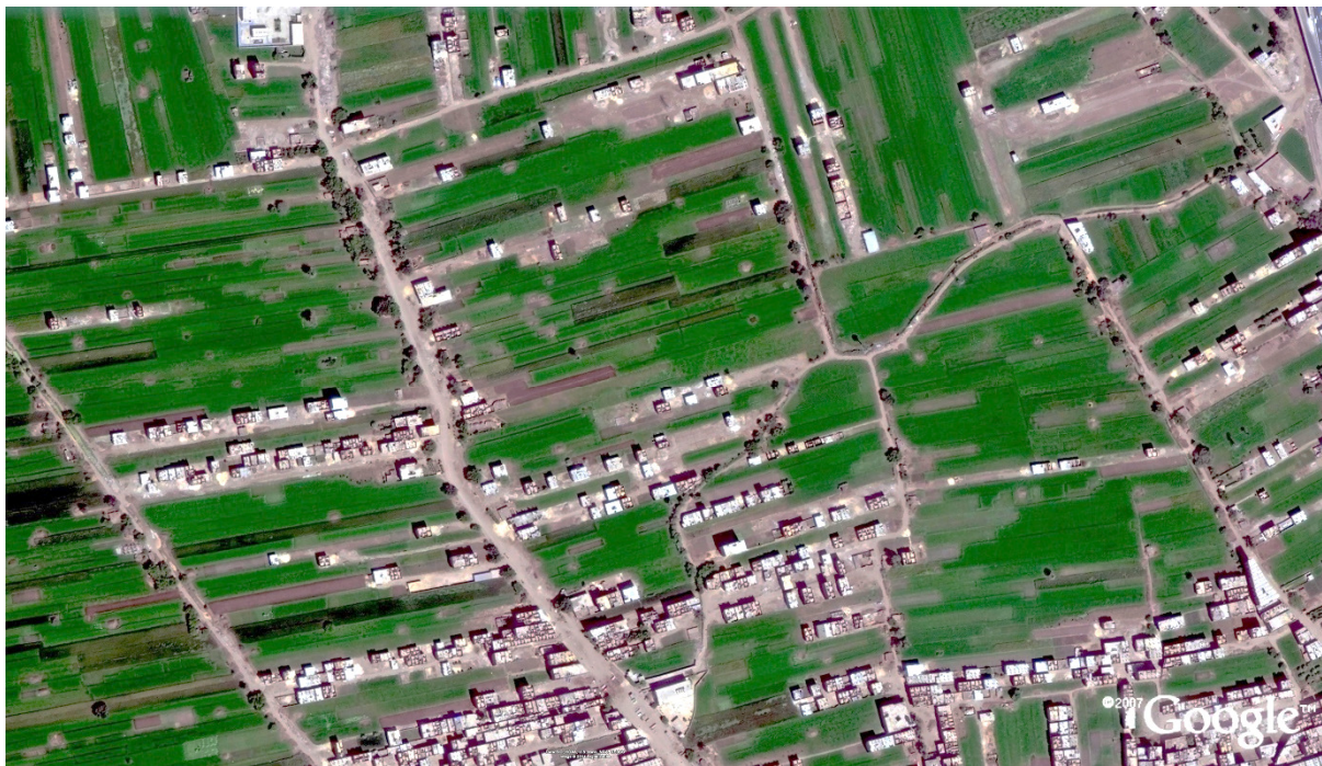
Fig. 3 – Incipient stages of sprawling upon agriculture lands in the north of Greater Cairo Region (GCR) abutting the ring road.