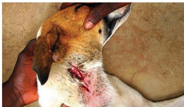
Fig. 2. A gash from an encounter with a baboon (Original photo)

Individuals that owned one or two dogs used in this study tended to be keeping them for companionship and personal security. However, there were two cases where larger packs of up to 6 dogs were owned to protect crops from animals such as baboons and for hunting — both legal and illegal (Fig. 2). There were also a few statements made that the dogs were occasionally a source of income by selling them to the Chinese quarry team located nearby. The dogs were all kept outside and very rarely allowed in the house beyond the veranda. Very few had visited the local veterinarian; for those that had received veterinary attention it was for rabies vaccination. No dogs had been given therapeutic or prophylactic worming medication due to a lack of education, widespread poverty and their isolated location. Upon receiving the information from the owner that the dogs had never been treated for endoparasites they were given free deworming medication as a re-