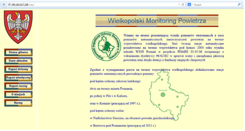
Figure 2. Main website of the Wielkopolska voivodship inspectorate for environmental protection

inspectorates. Websites of a few inspectorates (Małopolskie, Wielkopolskie, Lubuskie and Opole) are based on the same pattern (Fig. 2-3).