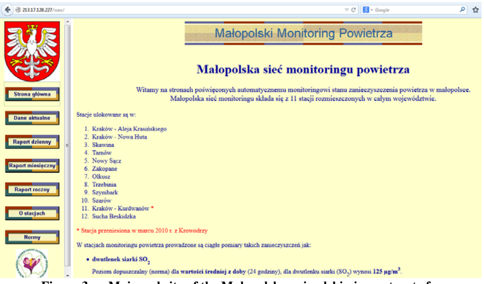
Figure 3. Main website of the Malopolska voivodship inspectorate for environmental protection

The choice of stations for which the user may view the results is made in one of the two ways: from a map or from a list. The latter is used by inspectorates in Małopolska, Wielkopolska, Łódź, Opole and Silesia. Other inspectorates use a map for this purpose. A more interactive version employs Google maps (Masovia, Pomerania, Lower Silesia