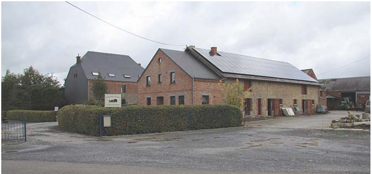
Fig 4. Walloon agritourist farm near Chimay, South-West of Belgium.

So, the nostalgic representation of agriculture and the desire for modern comforts lead to agritourist diversification that deviates from the appealing idea of valorising the working farm. Hence a share of the niche primarily devoted to farm tourism may be occupied by non-working farms. These non-working farms can more easily manage the nuisances of a working farm, create the illusion of being a farm and shape their buildings to tourists' expectations.