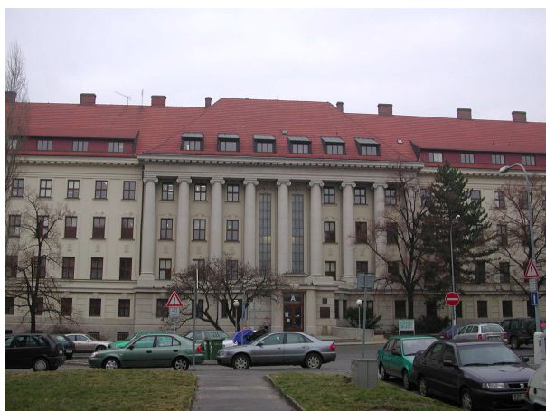
Fig 1. MUAF main building built in 1919

programmes with 27 follow-up Master's fields of study and 19 study programmes with 29 postgraduate fields of study.