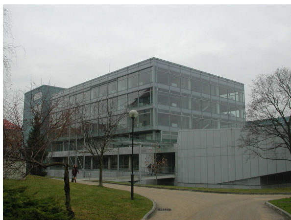
Fig 2. MUAF "Q" building where the UAKE seats

The research programme of the University follows the trends in contemporary development of the fundamental scientific fields, biology in particular, and their application in agricultural, forest, horticultural and economic sciences. In compliance with the outcomes of the Common agricultural policy of EU, the university's priority is the topics concerning multifunctional agriculture and forestry, and the implications of their production and outside production functions while shaping the landscape and developing the countryside.