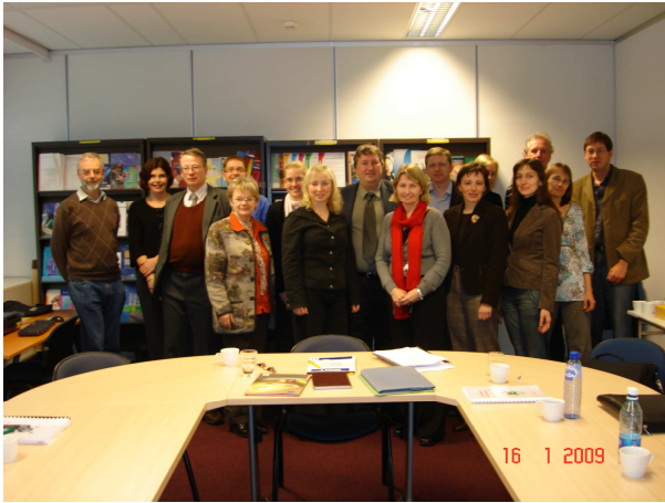
Fig 5. DERREG kick-off meeting