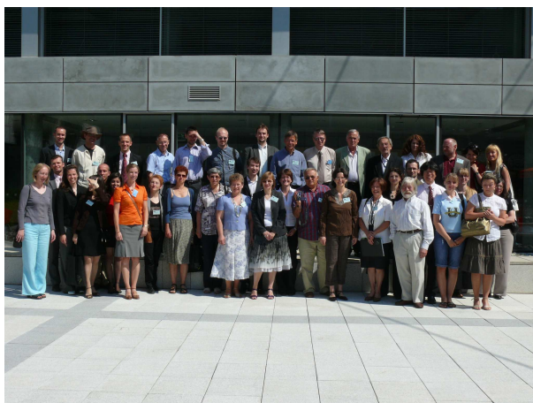
Fig 3. EURORURAL '08 participants

The excursion was directed to rural landscapes of Southern Moravia. The participants climbed the Pavlovské vrchy Hills where had a possibility to observe controversial Nové Mlýny waterwork among others. They moved via small towns Mikulov and Valtice to the Lednice-Valtice landscape area. This unique artificial landscape is a part of the UNESCO world heritage. The excursion finished in Bořetice - the village of the year of 2005 and its famous Free Federal Republic of Kraví hora - a concentration of vine cellars offering Moravian vines to the tourists.