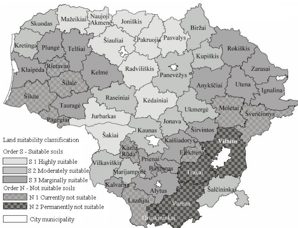
Fig. 1. Lithuanian agricultural land by the agro-ecological suitability for the generic agricultural use.

that is, lower by 35.57, 59.98, 68.81 and 76.45% when compared with Class S2, Class S3, Class N1 and Class N2, accordingly. The counted share of agricultural land has amounted to 25.02% on all agricultural land of country. Additionally, the relevant highlight is the land productivity of the land under investigation, which reached up to 48.15 point, and it's higher by 13.08% than an average of Lithuanian agricultural land. Considering the presented results, this class has the most optimal and favourable natural agro-ecological and environmental conditions, that is, prevail fertile and well-drained soils, flat or gentle terrain, for agricultural development in the content of all formed suitability classes. Estimated amount of natural agro-environmental factors determinates favourable opportunities for a wide range of the agricultural activities or specific types of agriculture and farm economic performance.