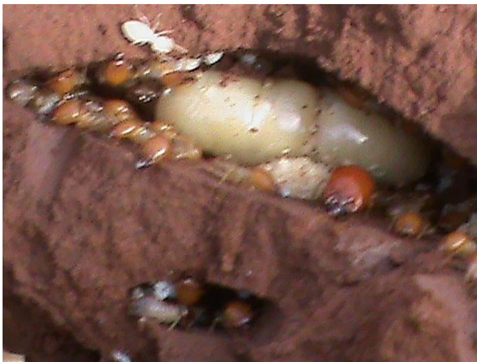
Fig. 3. A queen laying eggs in a royal cell.

M1 is somewhat bulky in size with 1.36 m in height. It was dug down vertically to the earth to find out new information on the entire termites colony. While digging the mound, it was observed that termites were annoyed and diffusively rushed to find strong protection for the colony, particularly for the queen. Several queens were found at different depths of the mound with slim adult males (the kings) lying next to it in a small chamber. For the purpose of the research, one of the queens found at 3 m depth under the mound laying eggs in a royal cell (Fig. 3) was randomly selected for laid eggs calculation.