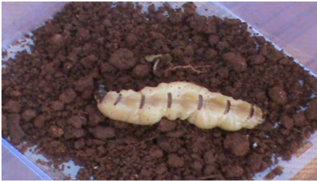
Fig. 4. Unearthed queen.

Termites live deep in cavities of mounds or nests and mostly laid eggs are accumulated in a special chamber to get direct feed until they develop into imago stage. The colony of termites consists of one pair of reproductive group and a set ratio of soldiers to workers and nymphs. If members of any caste are lost, additional members develop from nymphs to restore the balance and the number of termite individuals in castes in a colony is closely regulated naturally. Both reproductive and soldier castes secrete a pheromone (chemical signal) that is transmitted through food sharing and grooming to other members of the colony and inhibits development of reproductive group or soldiers. If the caste balance of the colony is upset, some undifferentiated nymphs do not receive the pheromone message and thus develop into reproductive groups or soldiers, thereby restoring the balance.