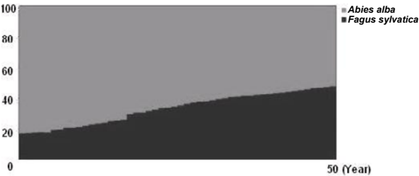
Fig. 4. Changes in the proportion of biomass of tree species in the studied tree stand forecasted by the model FORKOME (X-axis – year of simulation, Y-axis – a proportion of tree species in the biomass).

The analysis of tree stand development within a single patch cannot reflect the full picture of forest development dynamics, which is a larger area consisting of many patches. In such case, more credible results can be obtained with application of cellular automata in the form of CELLAUT model.