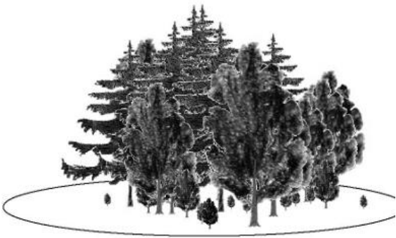
Fig. 3. Final picture resulting from simulation in the model FORKOME.

In subsequent years of simulation, the proportion of beech trees (regarding the biomass) within an analysed area increases gradually but continuously from about 20% in the beginning, up to about 50% in the last year of simulation (Fig. 4).