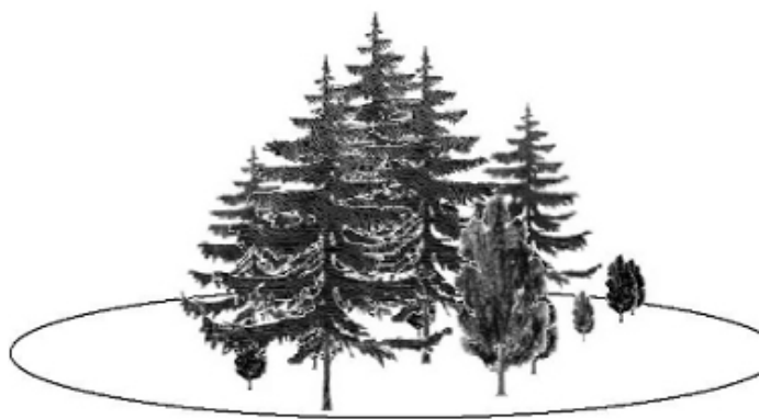
Fig. 2. Initial picture of simulated area in the model FORKOME (prior to the simulation).