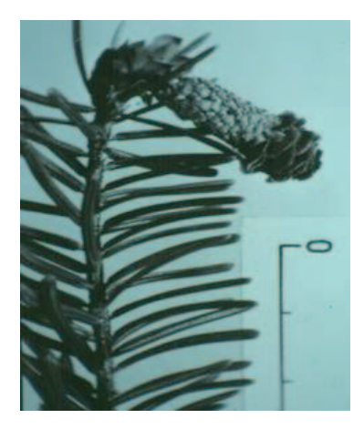
Fig. 2. The occurrence of bisexual strobiles in Serbian spruce.

Based on the above, the Serbian spruce intra-specific differentiation can be compared to the process of allopatric speciation (Chiras, 1991). Due to the geographic isolation and sharp changes of environmental conditions, the former widespread Serbian spruce populations started to divide. The small populations fragmented gradually, colonized the most favourable sites and thus became separated by ecologically unfavourable areas. The period of isolation was followed by the fragmentation into still smaller populations, or the so-called demes (Gilmour, Gregor, 1939). 280