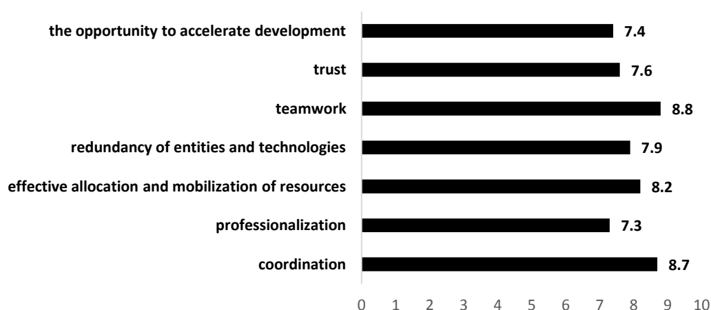
Fig. 1. Importance of success factors in crisis management

not selected by accident - the consideration was given to places, where crisis situations had occurred within previous 10 years. The research was intended to assess the present condition of crisis management and the local government entities' interest in the possibility of expert systems implementation in the field of crisis management. In the first part of the research, the respondents provided some information on their assessment of the functioning of the crisis management system so far. It should be noted that the actions undertaken within the existing system allowed to minimize or remove any adverse effects of the occurred crisis situations in majority of the communes (13), while the adverse results of a crisis situation were higher than those assumed. At the same time, more than a half of the respondents (11 persons) claimed not to see any need to improve the crisis management system. Within the scope of the discussed research, attention was also drawn to the meaning of success factors in crisis management. The factors selected and described in the literature of the subject were submitted for the respondents' evaluation (Lettieri et al., 2009). This evaluation consisted in determining the importance on a scale from 1 to 10 (where 1 - the least important criterion, 10 - the most important criterion). The respondents allocated the highest score to team work and coordination, and the lowest to professionalization (Fig. 1).