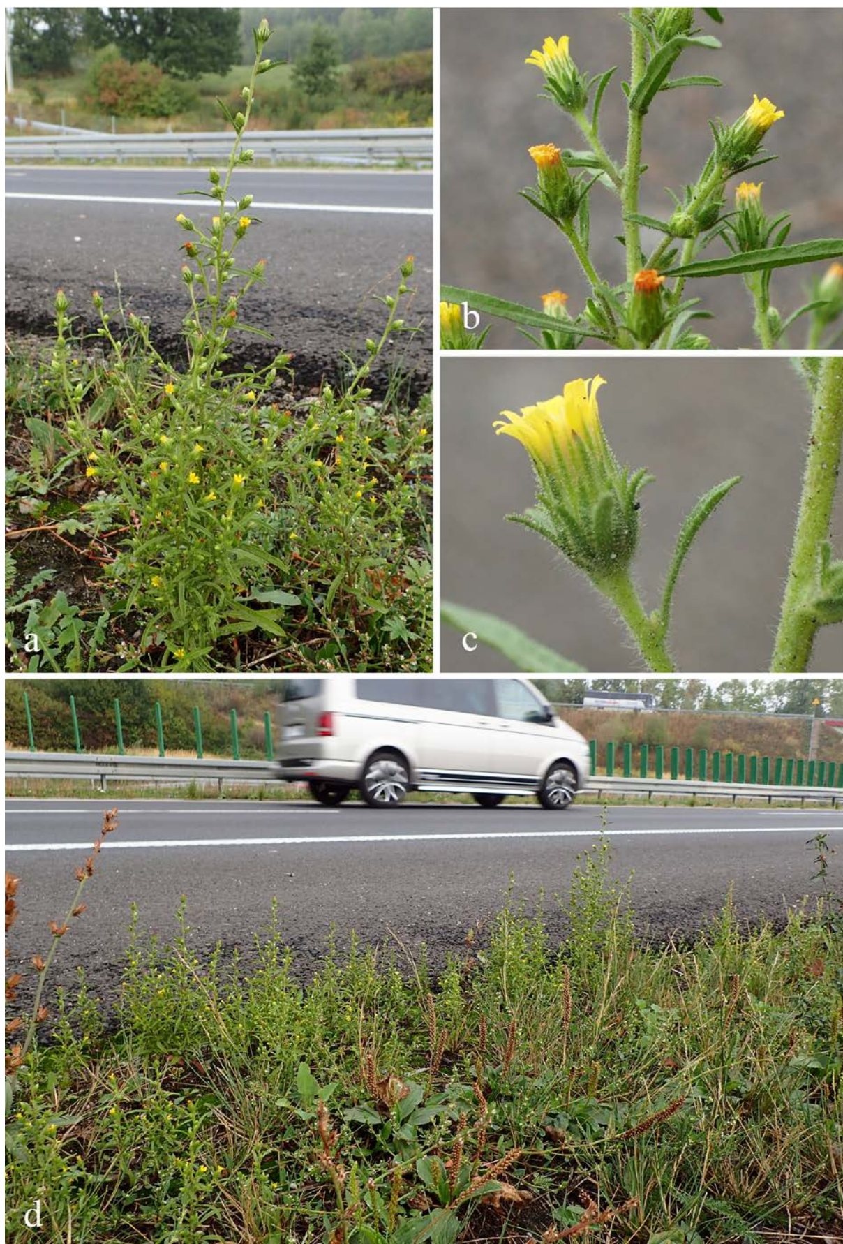
Fig 1: Dittrichia graveolens : a – plant, b – inflorescence (detail), c – flower head (detail), d – habitat, road verge on the S1 expressway in the direction of Bielsko-Biała (19. IX. 2015).