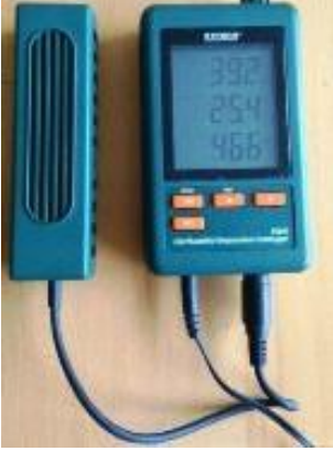
Figure 2: Extech SD800