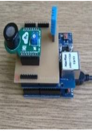
Figure 3: Arduino Unobased measuring device fitted with low-cost sensors

Air quality Air quality parameters were continuously measured for 23 days using the commercial CO2 data logger Extech SD800 (Fig. 2) and the Arduino Uno-based measuring device fitted with low-cost sensors: DHT11 (a temperature and relative humidity sensor), MQ-135 (a poisonous VOCs sensor) and MQ-4 (a methane sensor) (Fig. 3). According to the manufacturer, MQ-135 reacts to the presence of NH3, NOx, benzene and smoke. The present low-cost approach was based on the use of uncalibrated VOCs and methane sensors. The precise ppm calculations