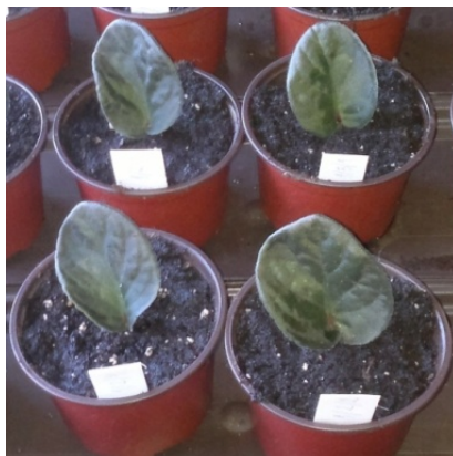
Figure 2. Planted leaf cuttings of African violets ( Saintpaulia ionantha H. Wendl.) cv. 'Nagano'

Incit-1 and Incit-5 are rooting hormones which were used in the experiment. The lower parts of petioles, approximately 1 cm from the cut, were dipped in the hormones. Incit-1 and Incit-5 contain plant hormones from the auxin family-1-NAA (1-naphthaleneacetic acid) in the concentrations of 0.1% and 0.5% respectively. There were three groups of plants in the experiment: the plants treated with Incit-1, the plants treated with Incit-5, and the control group. Each group consisted of 30 samples. Following the treatment with rooting hormones, the plants were planted in pots (Ø10) on 18 May 2015 (Figure 1). All pots were maintained in a greenhouse until the end of flowering at 25 \pm 1^\circ\text{C} . The following parameters were observed: the occurrence of the first root (days), the number of formed secondary roots and root lengths (cm), the occurrence of the first leaf (days), and the occurrence of the first flower (days). The first measurement of root lengths was performed 19 days after planting, whereas the second was 6 days after the first measurement, and the third was 6 days after the second measurement.