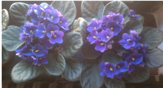
Figure 1. African violets, Saintpaulia ionantha H. Wendl. Var. 'Nagano'

The initial cutting material was taken from ten different African violet plants ( Saintpaulia ionantha H. Wendl.) Var. 'Nagano' (Figure 1). The copies of the mother plants are shown in Figure 4. For the purpose of this research, a total of 90 samples were taken.