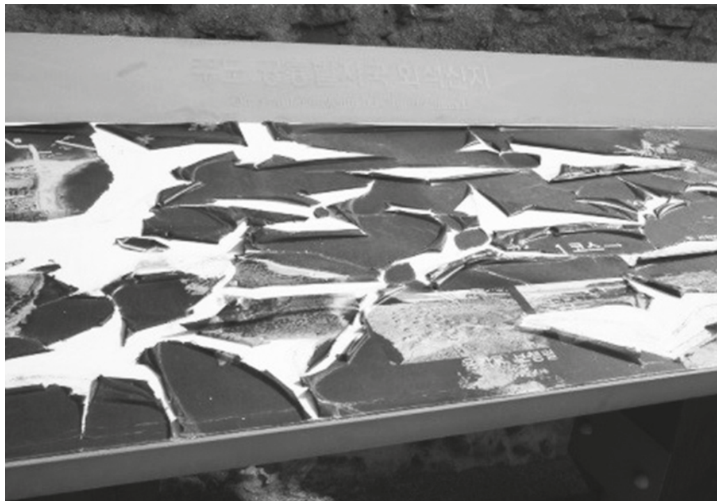
Figure 5 Dysfunctional interpretive panels located at high profile dinosaur fossil sites located in South Korea. Interpretive panels are only effective if there is adequate funding for the monitoring of weathering, storm damage and vandalism. Such situations can give visitors the impression of management neglect.