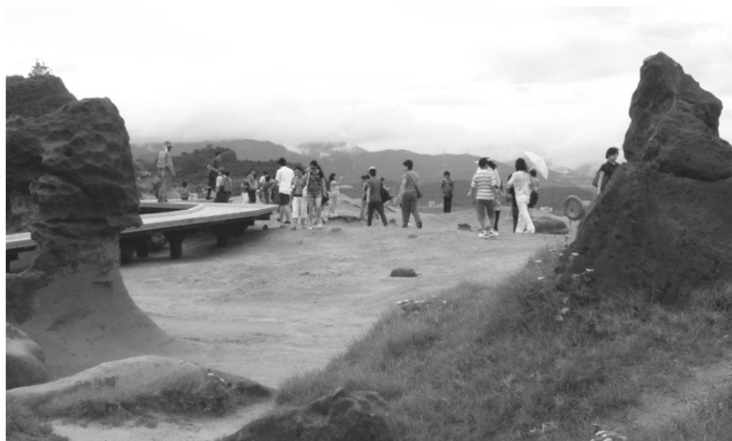
Figure 3 Where pathways and boardwalks are present, they do not contain visitors who tend to roam at random across the entire area of sandstone pinnacles. Overall, the capacity to manage this site even on moderately busy days is very limited and much of the park is not effectively managed in terms of public access to landforms with people crossing nominated restricted access zones. Yehliu Geopark, Taiwan.

Lessons learned from the study show that the management of a site can be ineffective and can even lead to a management footprint that carries a significant impact in its own right (Figure 3). Management actions have resulted in the development of hardened walkways, viewing platforms, installation of educational materials, life saving equipment points, a boardwalk, barriers, extensive signage, security camera points and signed restricted areas. The end result is an overdevelopment scenario, in the form of a substantial management footprint, which fails to contain and even adds to negative impacts on the natural values of the site (Newsome et al., 2013). The presence of wardens does not prevent visitors climbing over the landforms and with an estimated 10,000 visitors in a single day, the congestion results in people straying from paths, not using the boardwalk and not adhering to park regulation specified “no-go” areas. The case illustrates that when there are large numbers of tourists, it is extremely difficult to effectively manage them.