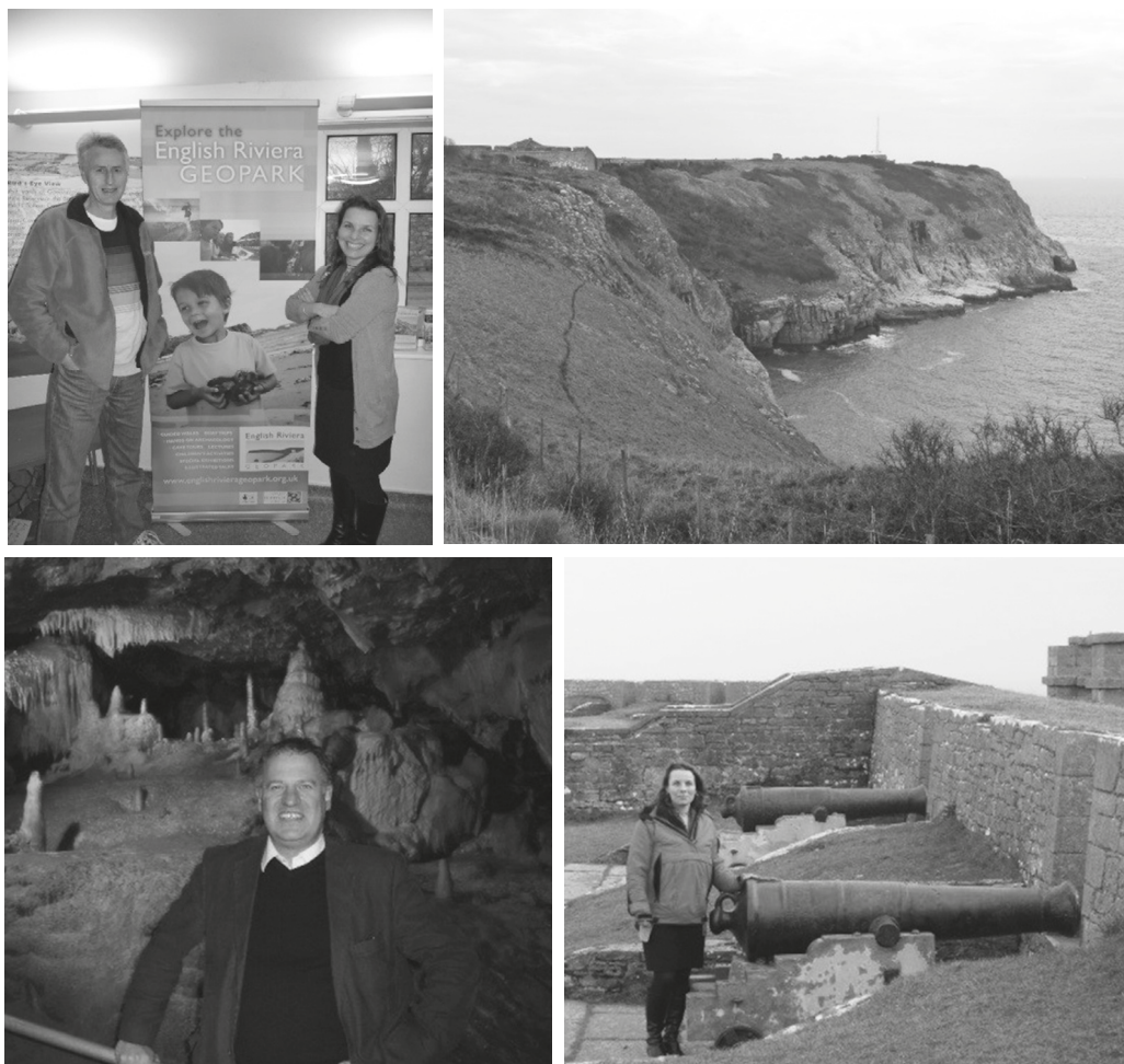
Figure 2 The English Riviera UNESCO Global Geopark, United Kingdom