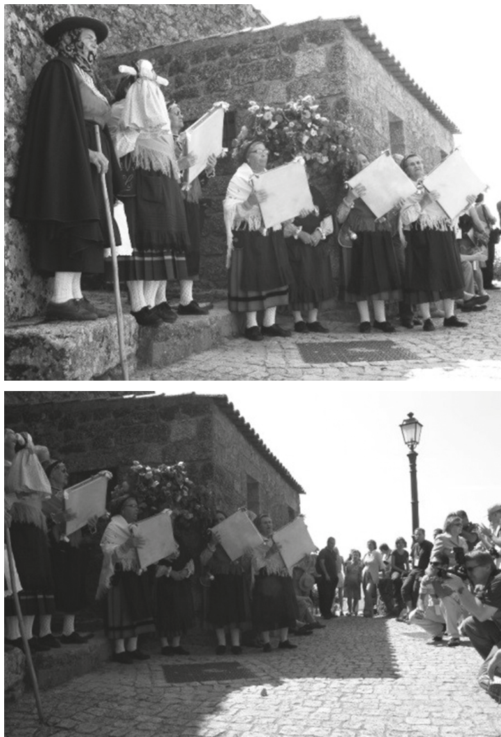
Figure 6 Naturtejo da Meseta Meridional UNESCO Global Geopark, Portugal is located in the centre of Portugal, near the border with Spain. Since its establishment in 2006, it has revitalised the interest of local people in their arts, crafts, music and culture. Here a group of local musicians and singers presents to an audience of participants from the 8th European Geoparks Conference in 2009.