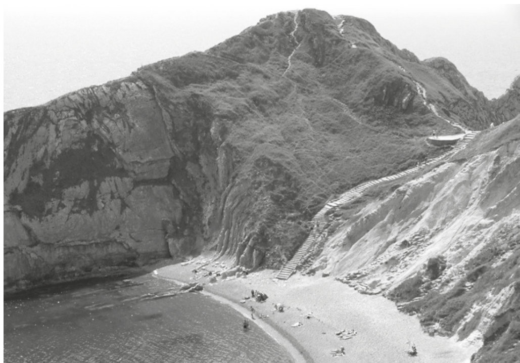
Figure 4 Recreational beach access along the Jurassic Coastline World Heritage Area, England. Soft rocks, visible as bare areas, on the right side of the photo are easily eroded and access needs to be managed as illustrated by the constructed viewpoint and stairway located in the central part of the photograph. Informal (user created) trails are visible leading from the viewpoint illustrate the important point that visitor behaviour needs to be anticipated and managed accordingly.

Geological sites can become significantly degraded as a result of the cumulative impacts of visitation. One such example is Sibayak Volcano in Indonesia where there is significant access trail degradation, modification of the crater floor, graffiti, littering and summit trail proliferation. The lack of visitor guidelines and absence of interpretation to guide visitors can also be viewed as an additional negative impact (Newsome, 2010). The Sibayak Volcano example serves to point out that even naturally changing, and to all extents and purposes wild, geotourism destinations, can become degraded by heavy visitation. Visitor pressure is also exacerbated by a lack of site management, poor