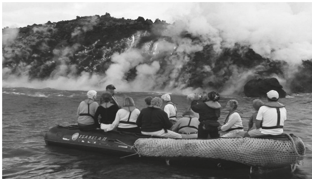
Figure 7 Volcanic eruption, Fernandina Island, Galapagos, April 2009. This impressive large-shield volcano has been erupting every four-five years, and its latest eruption was in April 2009. The eruption started off a radial fissure up in the slopes of the volcano and gradually the lava made it to the shoreline. The fissure was located about 14 km from the shoreline. As lava entered the water, a tremendous amount of water vapor was released, and provided the geotourists with an exciting experience.