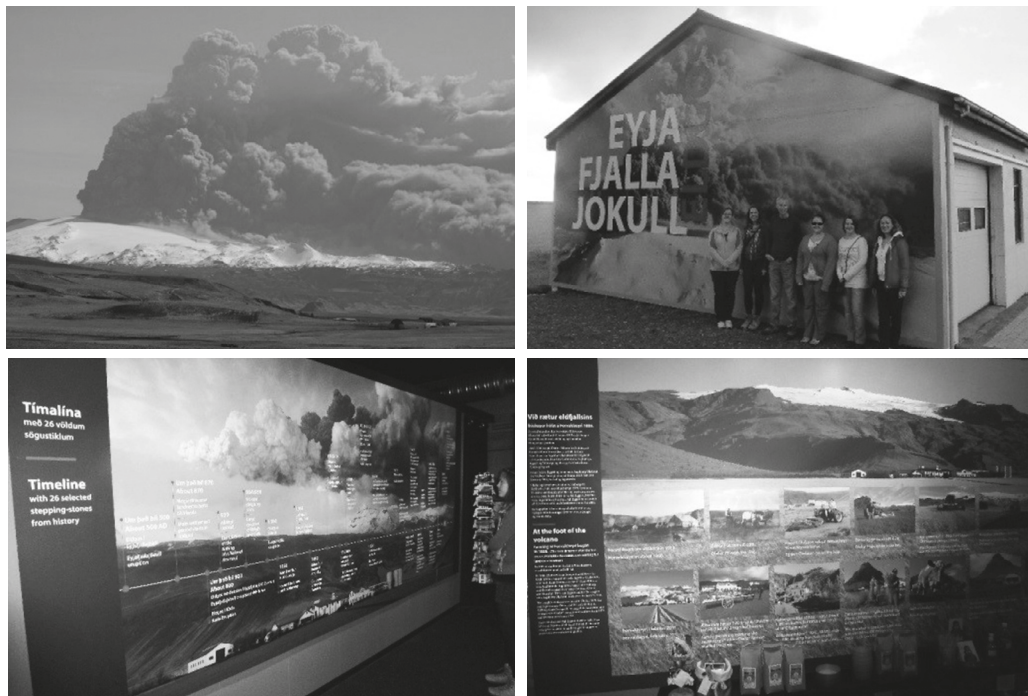
Figure 8 Eyjafjallajökull is a volcano completely covered by an ice cap in Iceland. When it erupted in 2010, it caused enormous disruption to air travel across western and northern Europe over an initial period of six days. At that time, it was dubbed “the volcano that stopped the world”. Since that time, it has become a major geotourism attraction which has spawned a local world class geo visitor centre.

Upper Left: Eyjafjallajökull in eruption in 2010. Upper Right: The Eyjafjallajökull Eldgos Visitor Centre started by the local farmer's wife Guðný. Lower Left: The visitor centre has excellent geological interpretation throughout. Lower Right: It uses the geological knowledge to inform how living in the shadow of the volcano influences life in the region. Thus, it presents a more holistic geographic approach to geotourism which presents the relationships between its geological (Abiotic), plants and animals (Biotic) and how people live there today (Cultural) elements.