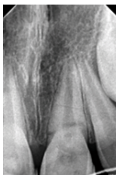
Figure 2. The state at 5 months after the injury – no signs of resorption