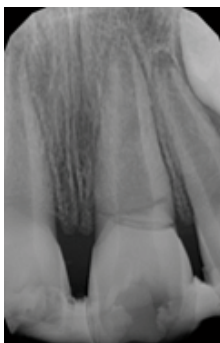
Figure 1. The state at 1 week after injury

of resorption, but also a widening of the periodontal cracks, and no signs of healing of the fracture line (Fig. 2). It was only after 14 months (in a radiograph) that the first signs of healing within the fracture line were noticed in the form of mineralized tissue and narrowing of the canal (Fig. 3). The response to thermal stimuli was still reduced. After orthodontic consultation, it was decided to leave the ligatures in place due to a very unfavorable location of the fracture line in the area of the tooth neck, as well as the presence of undershot in the patient. Still, in view of a satisfactory course of treatment, but incomplete fusion of the bone fragments, the above-described treatment will be continued.