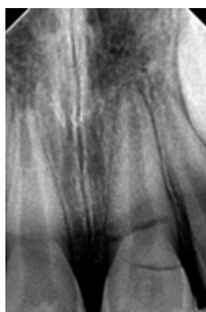
Figure 3. The state at 14 months after injury. The healing of the fractured root using mineralized tissue around the fracture line of the dental root 21