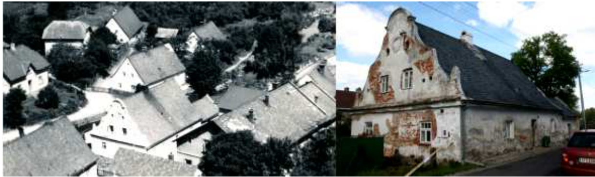
Fig. 1: The researched object – a rural house No. 98 in Vápenná.