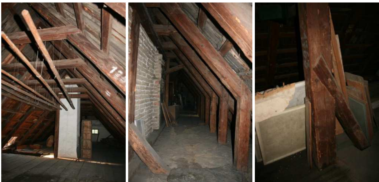
Fig. 2: The inner view of the truss.

Most of the joints used are dovetail joints fixed by wooden stakes. Tenon joints are used in case of the anchor posts and rafters with binding beams.