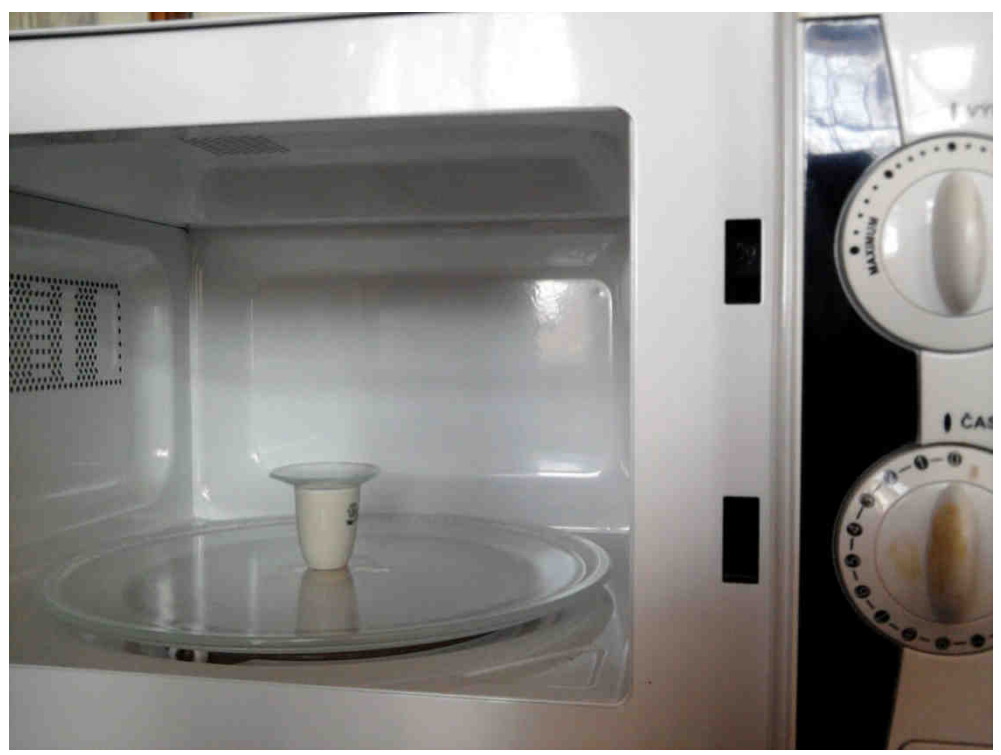
Fig. 2. Solvent-free synthesis of sulfanilic acid in microwave oven