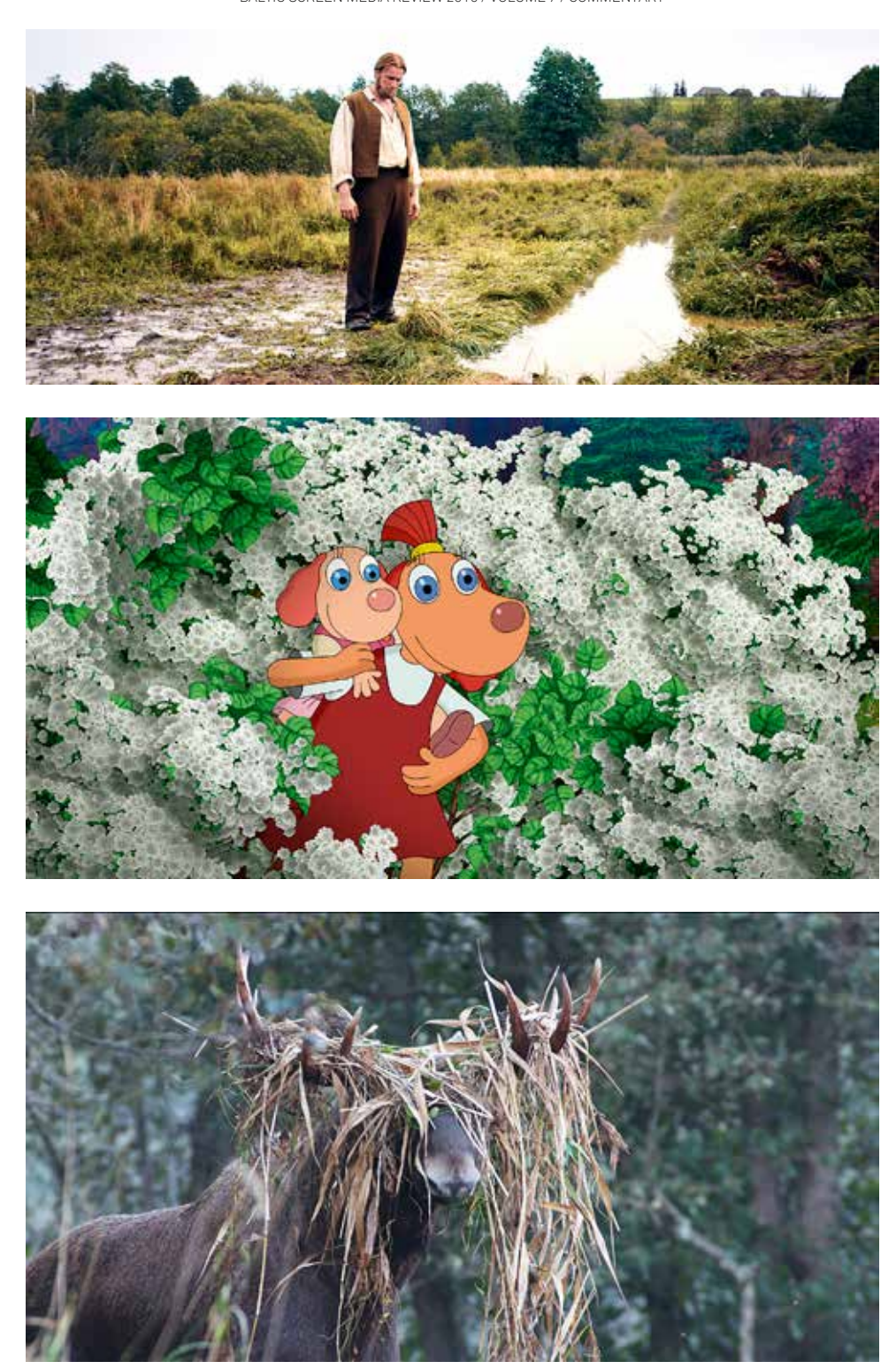
FIGURE 2. Film screenshots for a selection of Estonia 100 films.