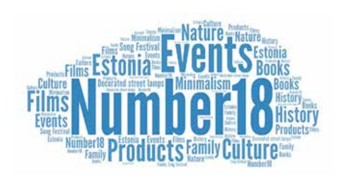
FIGURE 5. Respondents' associations with the 100th anniversary of Estonia (n=102).

FIGURE 6. Respondents' associations with the Estonia 100 brand (n=92).