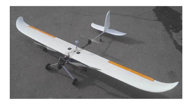
Figure no. 1 The functional solution aimed by the project

The expected steps to be taken (technical study, technical documentation, functional model, prototype, technological demonstrator etc.) are: