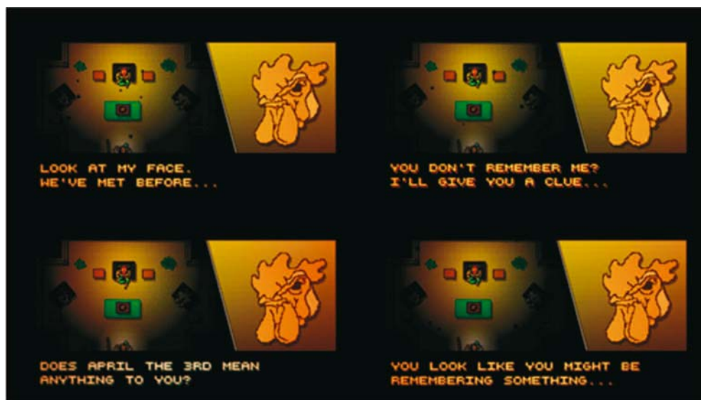
Figure 1. Jacket’s first encounter with the masked characters.