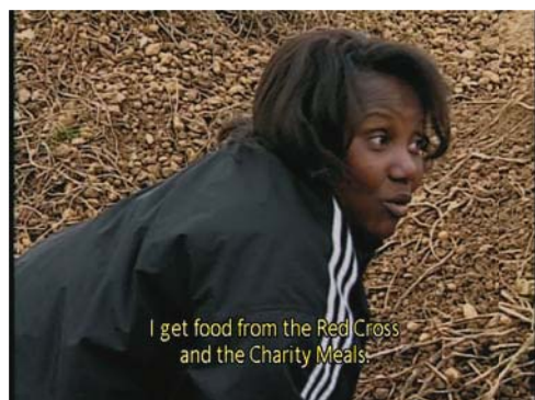
Figure 1. Gleaning for survival. Figure 2. A consumerist approach.