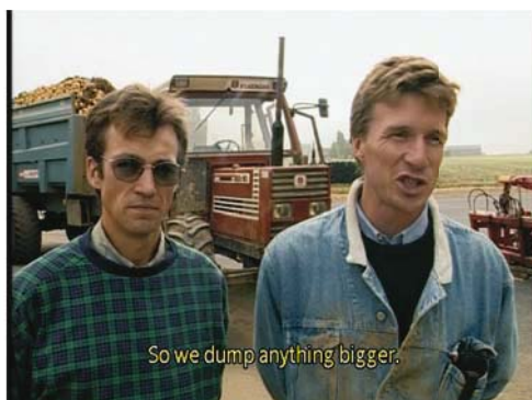
Figure 3. An artistic approach. Figure 4. Gleaning as an aesthetic gesture.