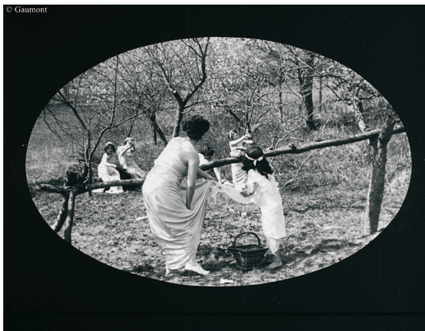
Figure 8. L'Éventail animé (Émile Cohl, F 1909, © Gaumont).