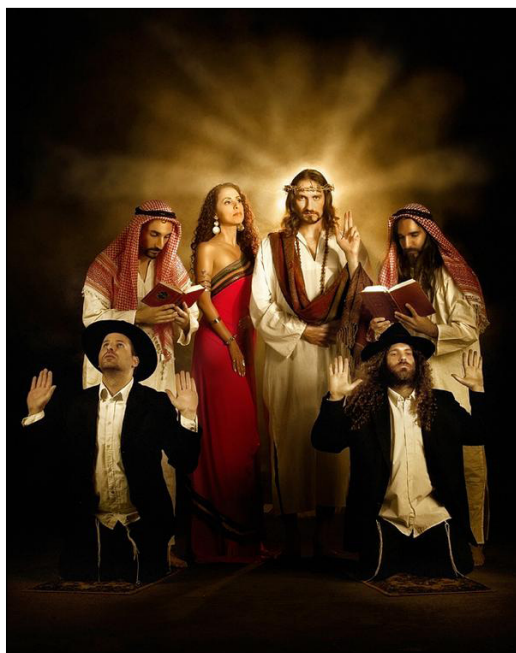
Image 5. Orphaned land in 2010

moon, and (3) a Lion with a cross. The three figures are the representatives of the three greatest Abrahamic religions: Judaism, Islam, and Christianity. Through the recording, these three members of a shared holy unity act together for the sake of humanity to build the Ark and save the True.