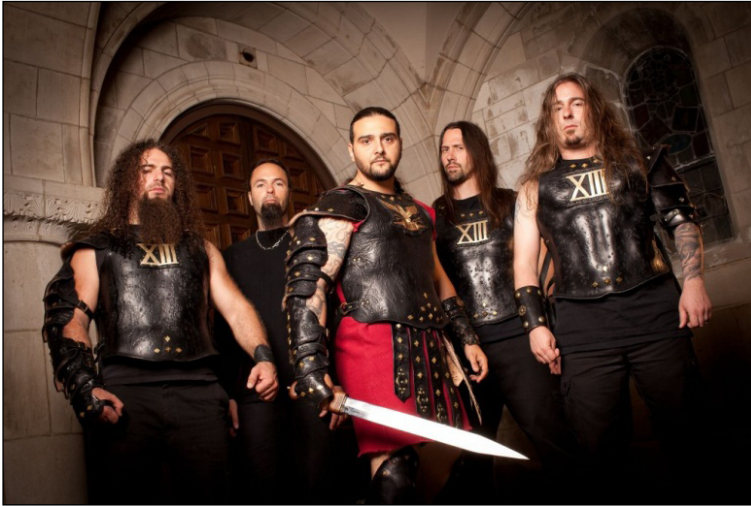
Image 6. Ex Deo in 2012