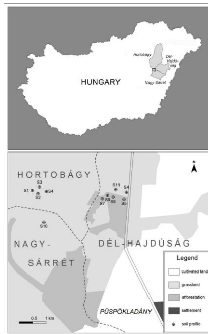
Figure 1. Location of the study area and the sampling sites in Hungary

Nagy-Sárrét is a recent alluvial plain interspersed with alkaline lands and flood-free areas. Part of it has basin-like characteristics, where in the deeper, artificially drained areas dominantly croplands and in small fragments natural grassland vegetation can be found. All soils of the landscape have been developed under influence of shallow groundwater and partially of temporary surface water cover, which is reflecting in topsoil, but more frequently in the subsoil properties. As a result of anthropogenic activities, these soils are mostly artificially drained, which is expressed in the lowering of groundwater level and the retreat of surface water cover [17].