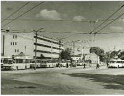
Fig. 21. New public nodes with transit character in Old Town [Photographs from the collection of Aleksandras Pleskačiauskas].