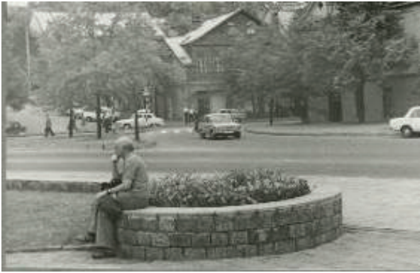
Fig. 12. Optional recreational activities in Kaunas city: Steigiamojo Seimo Square.