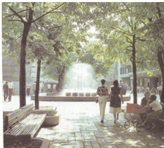
Fig. 11. Laisvės Avenue [32].

Safety. Human spatial scale helps ensuring “the eyes on the street” effect and the social control of spaces. The traditional perimetric urban structure, small scale and the clear separation (but no high walls and fences) of public and private spaces is favorable for safety ensured by social control.