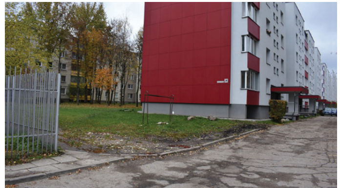
Fig. 32. Changing modernist neighborhoods in Kaunas: fragmentation of spaces.