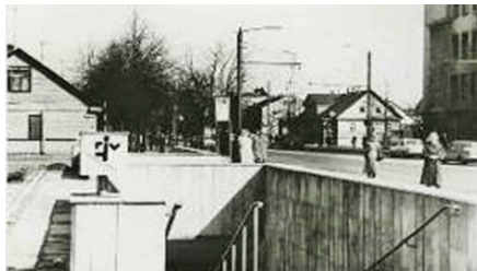
Fig. 26. Modernized urban fabric.