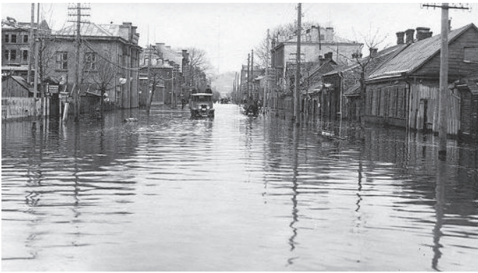
Fig. 8. Extreme situations in the center of Kaunas of the interwar period: Nemunas floods in the center of the city, photo by Veronika Šleivyte, KEM GEK 16111, Kupiškis Ethnographic Museum [30];