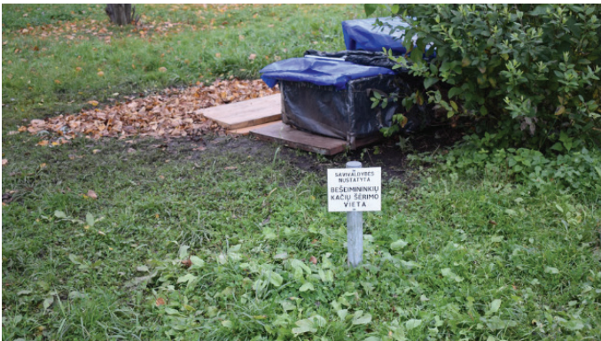
Fig. 31. Changing modernist neighborhoods in Kaunas: illegal cat feeding areas [Photo: Authors of the Article].