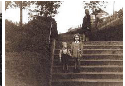
Fig. 6. Kauko city stairs [28];