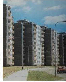
Fig. 23. Attention to the automobile in the modernist districts of Kaunas: clearly separated zones for cars and pedestrians [33].