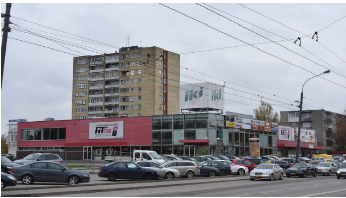
Fig. 33. Increasing accumulation of individual automobiles and visual advertisement in public spaces.