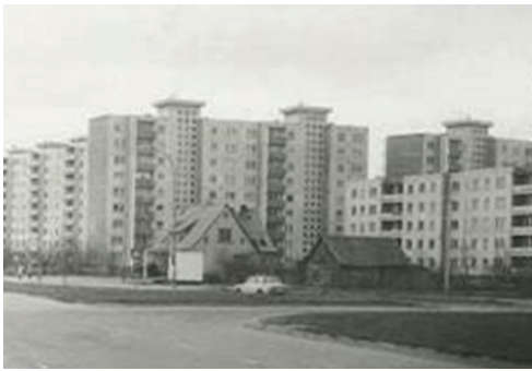
Fig. 16. New scale of modernist spaces of Soviet period Kaunas: a) modernized environment of Kalniečiai district;