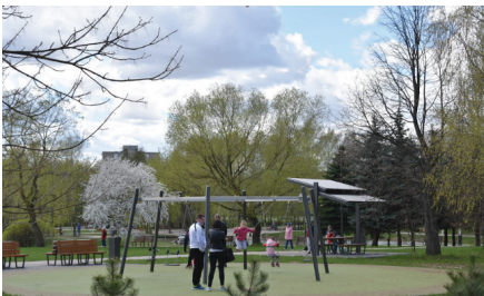
Fig. 28. Examples of optional or recreational activities in contemporary Kaunas.