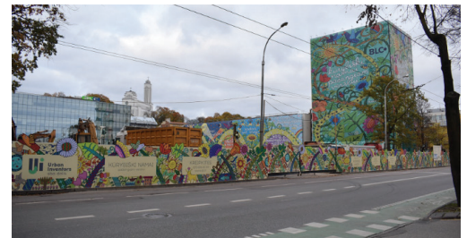
Fig. 30. Spontaneous attempts to embellish urban environment: business supported initiatives.

iting barriers in the images of the Soviet era provide an image of accessibility and safety (Figs. 25, 26). It is interesting that in the Soviet-era photographs the presence of uniformed officers in public spaces is higher. They appear much more often in the analyzed photographs of the Soviet era than in other periods.