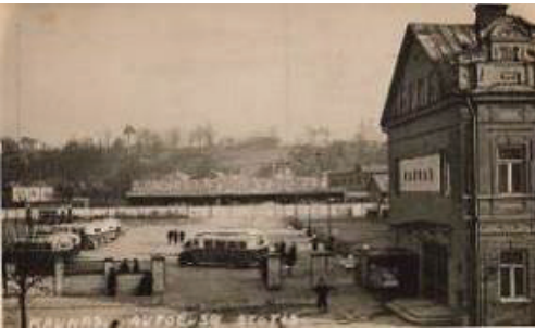
Fig. 4. New modern public transport and other transport facilities: Kaunas bus station in 1937 [26];