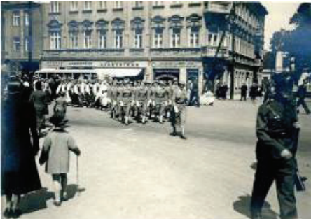
Fig. 1. The users and activities in public spaces in inter-war era: festive procession in the central streets of Kaunas in 1937 [22].