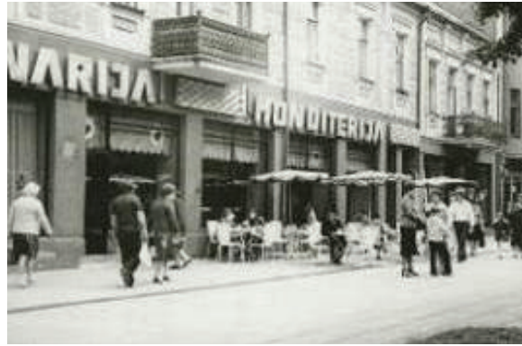
Fig. 13. Street cafes in Laisves Avenue.