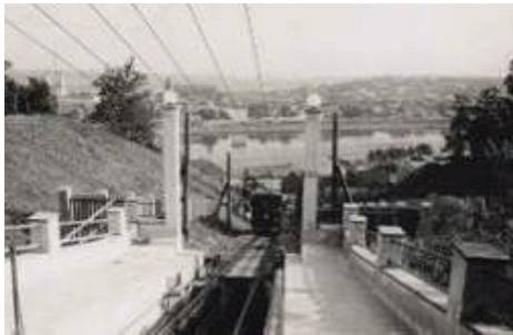
Fig. 5. Aleksotas cable car in 1937 [27];