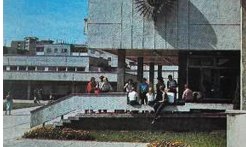
Fig. 15. Spaces in front of public buildings [33].

center and modernist districts centers become the clear point of attraction of the area, with the most frequent gathering of users. Another phenomenon observed in the images of this period — informal gatherings of people at the entrances to the public and multi-apartment residential buildings, which became a kind of informal public spaces (Figs. 14, 15). This phenomenon illustrates the social need for “space as a meeting place”, which corresponds to the personal and social space scale.