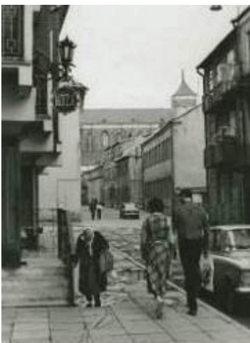
Fig. 10. Users of different age groups in public spaces of Kaunas in the Soviet period: Kumelių Street. Photographs from the collection of Aleksandras Pleskačias [32].