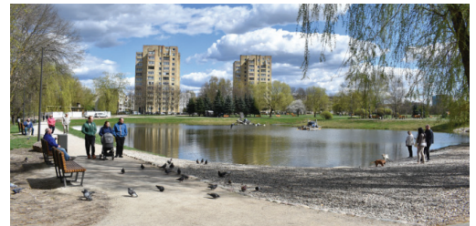
Fig. 27. Examples of optional or recreational activities in contemporary Kaunas.