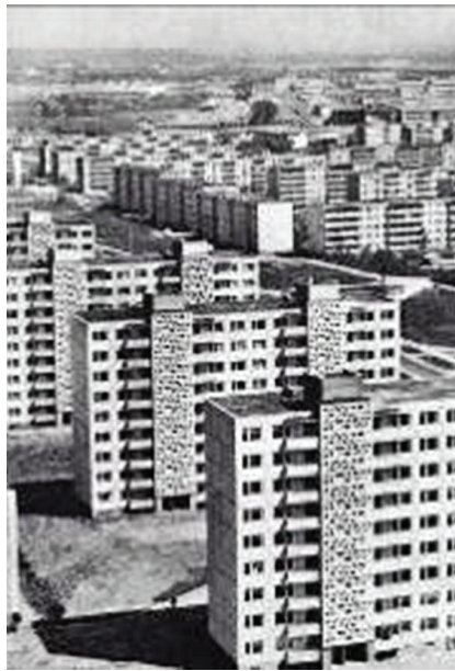
Fig. 17. Large scale modernist residential development [34].