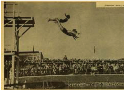
Fig. 2. A view from the yacht club water sports event on Nemunas island in 1938 [23].