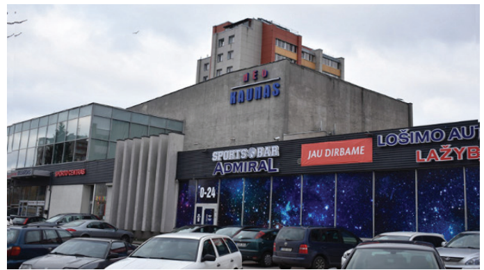
Fig. 34. Increasing accumulation of individual automobiles and visual advertisement in public spaces [Photo: Authors of the Article].

is compensated by the attempts of the residents themselves to embellish their living environment and by the emerging street art culture in Kaunas, both legal and illegal, well reflected in the media images (Figs. 29, 30). The new feature in the public spaces of modernistic neighborhoods appearing as a result of optional activities are both designated and illegal homeless cat feeding areas (Figs. 31, 32).