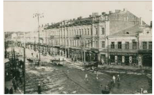
Fig. 3. Typical street space of the inter-war Kaunas: Laisves Avenue around 1935 [24].