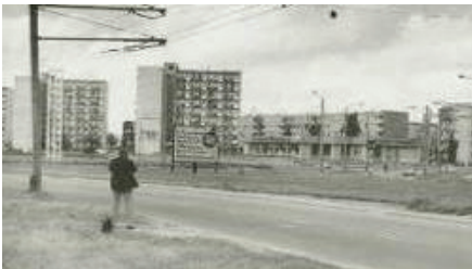
Fig. 25. Low level of social space control in modernist.