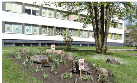
Fig. 29. Spontaneous attempts to embellish urban environment: individual.