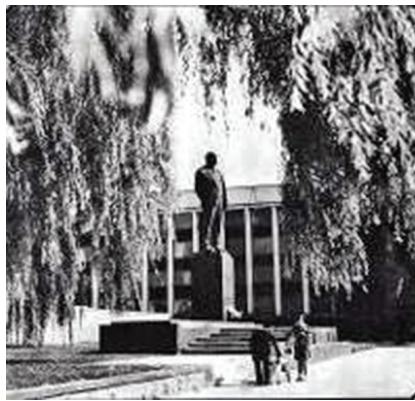
Fig. 20. Vienybės Square in the city center [34].

Mobility. The analyzed images demonstrate the increasing importance of public transport both in modernized and modernist urban areas. Due to the rarely used private vehicles (quite few of them are seen on the streets in the analyzed images) and very popular public transport, which was very important for communication in a territorially expanding city, the analyzed photos show a significant accumulation of users at public transport stops. The availability of public transport networks had influenced both the users and activities and development of public spaces. People waiting for public transport can be seen in the images both in the modernized and modernist neighborhoods (Figs. 21, 22). Development of public transport and mobility network of the Soviet period had created new public nodes with transit character visible in the analyzed photographs, these nodes had not existed before and some of them disappeared afterwards.