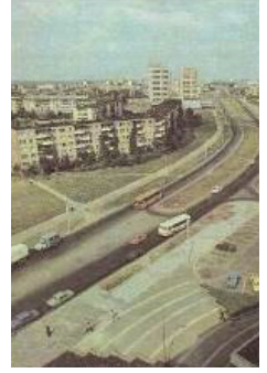
Fig. 24. Automobile infrastructure [33].