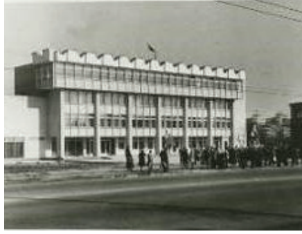
Fig. 22. Modernist urban fabric.