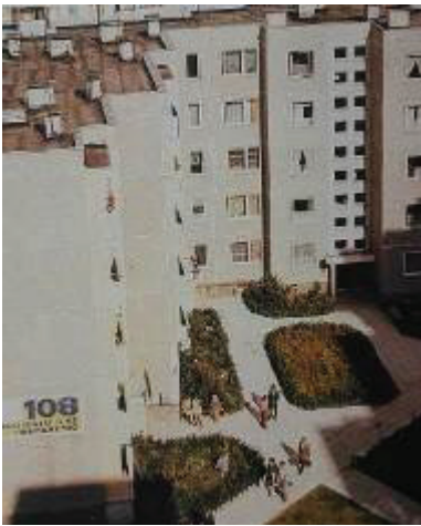
Fig. 14. New meeting points in the modernist districts of Kaunas city in 1980: entrances of multi-apartment residential buildings [24];