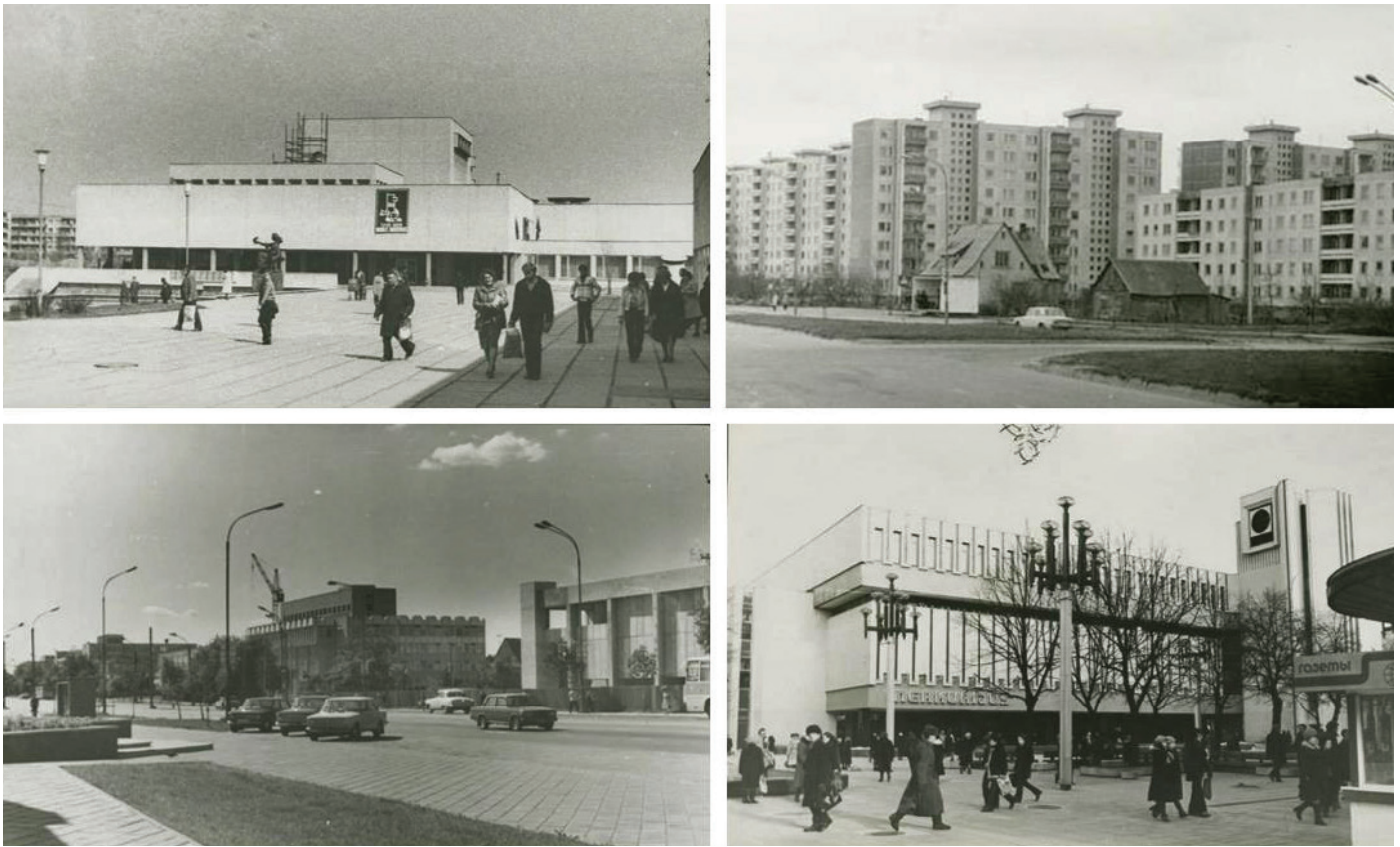
Fig. 1. Historical iconographical material: public spaces developed or reconstructed during the Soviet period in the photographs of 1980s by photographer A. Pleskačiauskas [18].

tions (inter-war era, period until 1960), in the era of modernization (1960–1990) and after it (Fig. 1);