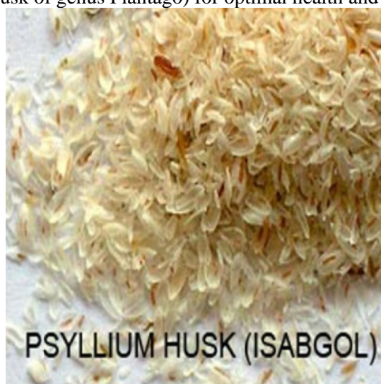
Figure 2: Psyllium husk, mucilage, tasteless material with health benefits

Furthermore, mucilage of the dried seed is used externally as an emollient in different parts of the world whereas in Iran water extract of dried seeds used externally for inflammation and orally taken seeds used for indigestion associated with bile secretion abnormalities. In Thailand and Spain, seeds of this plant used in different ways for the treatment of ailments like cold, diarrhea and chronic constipation [ 10, 11, 12]. There is growing body of literature supporting the beneficial effects of psyllium (mucilaginous material prepared from the seed husk of genus Plantago) for optimal health and diseases prevention.