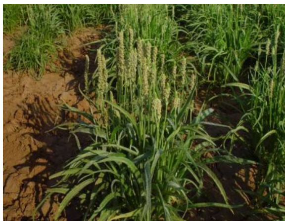
Figure 1: Plantago ovata native to India