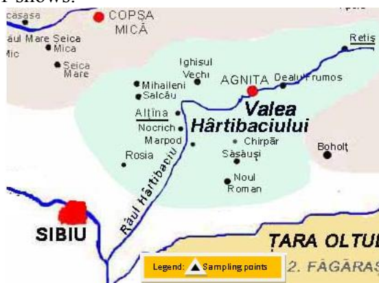
Figure 1 Hârtibaciu River in Sibiu Depression with sampling stations

The study was carried out in Sibiu depression, along the Hârtibaciu River; the Hârtibaciu meadow has two clearly differentiated sectors, the sector upstream of Sibiu: Sibiu-Agnita and Agnita-Retiș. The studied farms are located along the Hârtibaciu River, averaging 250 goats with different production system. Water sample were collected from 4 different locations along Hârtibaciu River, as Figure 1 shows.