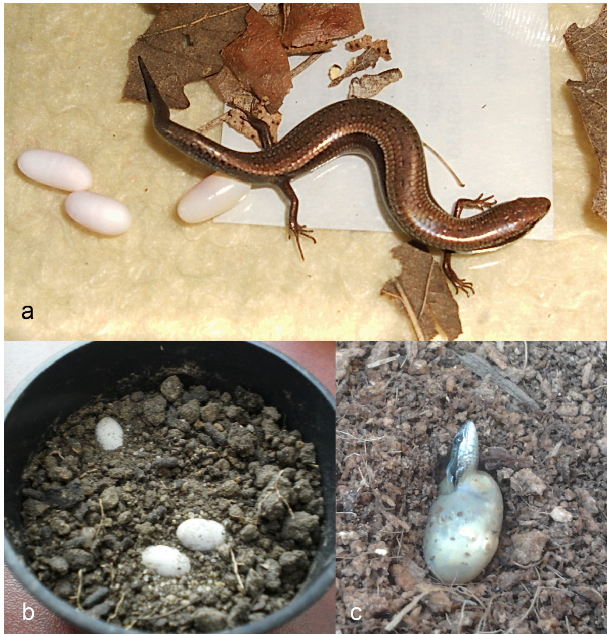
Figure 1. a – egg deposition from a female A. kitaibelii ; b – indoor egg incubation in plastic containers; c – hatching of a juvenile A. kitaibelii (after the phase of egg-shell rupture, the animal protruded the head outside the egg shell, but was still within the egg).

The smallest hatched specimen in our study was with measures of L_{cor} = 18,74 mm, and the longest was with L_{cor} = 22,00 mm. The smallest wild captured juvenile was measured L_{cor} = 22,00 mm and the longest was with L_{cor} = 25,30 mm. Actually, the lightest specimen was with a weight of 0,09 g, but with length L_{cor} = 20 mm, whereas the smallest specimen ( L_{cor} = 18,74 ) was heavier (0,11 g). The statistically significant correlation of the weight and the body length of the juveniles is presented on Fig. 2, where p < 0,001 and r = 0,69 .