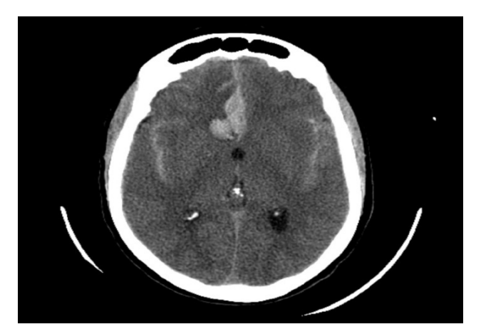
Figure 2 Aspect of subarachnoid hemorrhage with a suspicion of anterior cerebral artery aneurysm.

Oral prophylaxis is started for the cerebral vasospasm secondary to the subarachnoid hemorrhage with nimodipine: 60 mg every 4 hours. Blood pressure was maintained throughout the treatment at values of 160/90 mmHg.