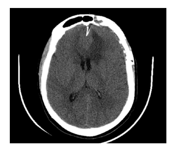
Figure 4 Aspect of frontal ischemia in the anterior cerebral artery area, predominantly on the right side.

territory being the one previously exposed to an intense subarachnoid bleeding – Figure 4.