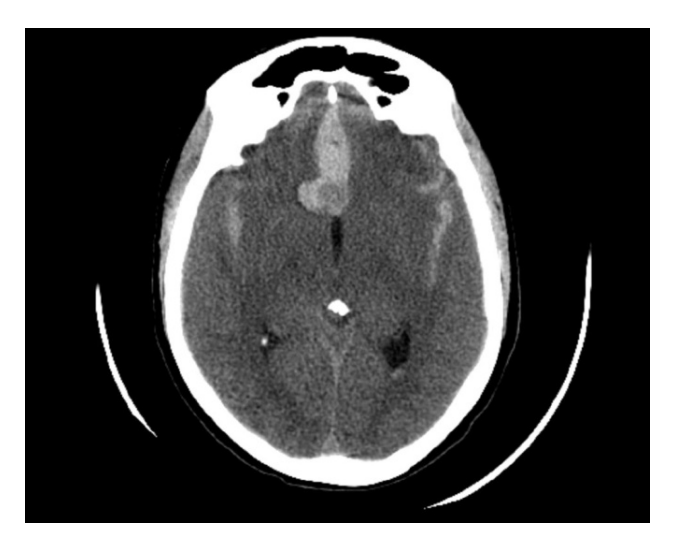
Figure 1 Subarachnoid hemorrhage in the anterior interhemispheric fissure with a possible anterior cerebral artery aneurysm.

space, predominantly in the anterior interhemispheric fissure and it suggested the presence of an aneurysm possibly belonging to the anterior communicating artery – Figures. 1,2.