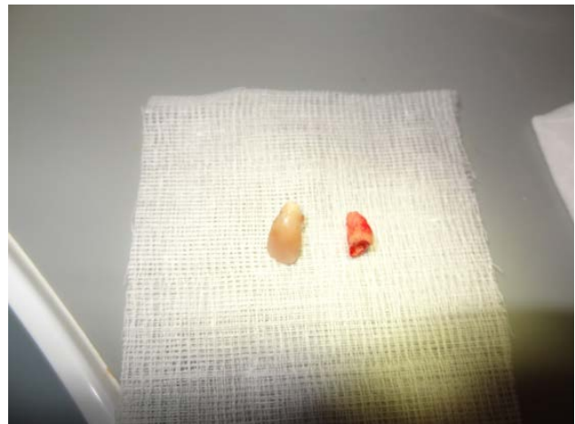
Figure 5 - Extracted tooth

to replace her missing teeth: a dental implant, a three unit bridge and a partial denture. The patient refused the dental implant because of financial reasons and the length of the treatment. The only option she has accepted was a dental bridge, although the classical treatment with a permanently bridge anchored on adjacent teeth: canine and central incisor involves an obvious massive sacrifice of healthy tooth substance.