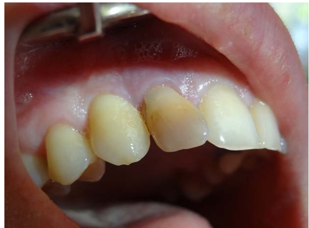
Figure 1 - Clinical view of the right upper lateral incisor showing discoloration

A female patient, 35 years old, has presented in our dental practice for dental treatment. We noticed the discoloration in her upper right lateral incisor (Figure 1). The tooth has presented a distal massive incorrect filling. The information the patient has provided revealed the fact that the tooth had been endodontically treated due to caries in the childhood. No history of trauma was reported. Ten years ago, after the endodontic treatment, the tooth was internally bleached by sodium perborate and hydrogen peroxide. Due to an unsatisfactory bleaching result after a number of sessions, the treatment was supplemented with in-office bleaching. The radiographic exam confirmed the endodontic treatment. The X- rays exam also revealed an important cervical root resorption in association with periodontal sockets and bone resorption.