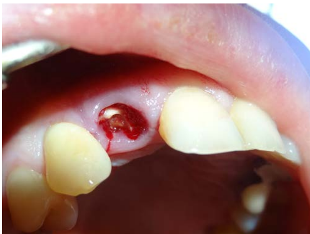
Figure 4 - Clinical view of the fractured tooth

The fracture was incomplete but the bone condition and the root situation imposed the tooth extraction (Figures 4 and 5).