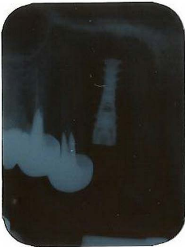
Figure 3 - Radiographic view of the implant immediate after insertion

After the three months period of osseointegration of the implant a clinical and radiographic exams have been conducted. At second stage surgery, 3 months three months after placement of the implants, titanium healing cap was connected. The final impression was made three weeks after second-stage surgery and the final ceramic restoration has been put into place. The patient was informed about the special care of a dental implant and the monitoring period at every six months.