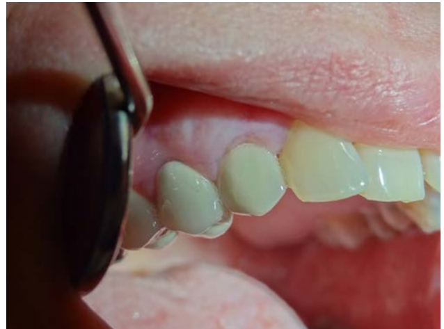
Figure 4 - Clinical situation 3 years after treatment

After a period of three years the clinical aspect of the restoration and the radiological one are excellent (Figure 4, Figure 5).