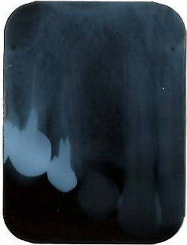
Figure 2 - Preoperative intraoral radiograph

conducted, as well as the local hard and soft tissues.