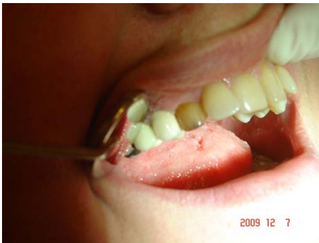
Figure 1 - Clinical preoperative view of the deciduous right upper canine

A patient, 39 years old, has presented in our dental practice for dental treatment. She was unhappy because of the mobility in her upper right canine and because of the discoloration of that tooth (Figure 1).