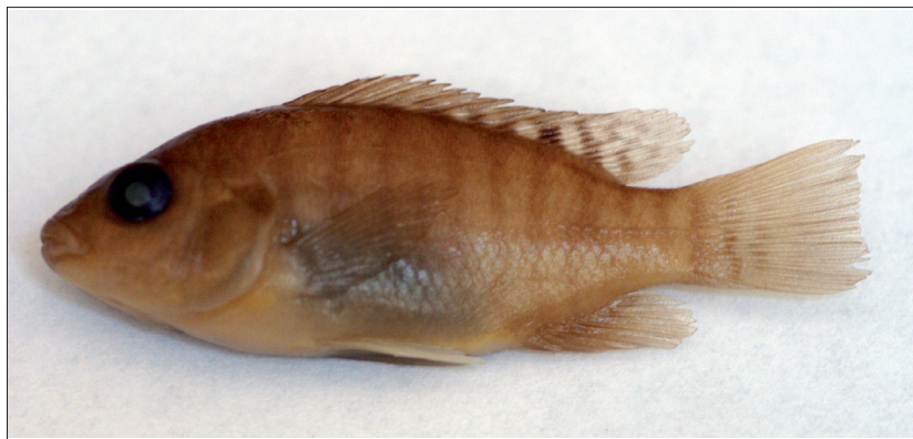
Figure 2. Juvenile O. niloticus captured in Lake Licheńskie.

The occurrence of Oreochromis niloticus (L.) was noted in the 1990s in heated waters of western and southern Poland, and it was caught by recreational fishers in the Rybnik Reservoir (Witkowski 2011). O. niloticus was noted in the heated discharge waters of the Konin and Pątnów power plants only in the Licheńskie Canal and in Lake Licheńskie in 2002-2003. In spring 2002, adult specimens, which had escaped from cages in the discharge canal, were observed in the canal and lake. Tilapia were caught in large numbers by recreational fishers. Specimens in Lake Licheńskie were noted to be in spawning color which indicated reproductive behavior. In the next year, one juvenile specimen measuring 35 mm in length with a body weight of 1.8 g (Fig. 2) was caught on August 19, 2003 in the littoral zone of Lake Licheńskie. In subsequent years, O. niloticus was not noted in the heated canal and lake system. During this period, canal cages of this species ceased.