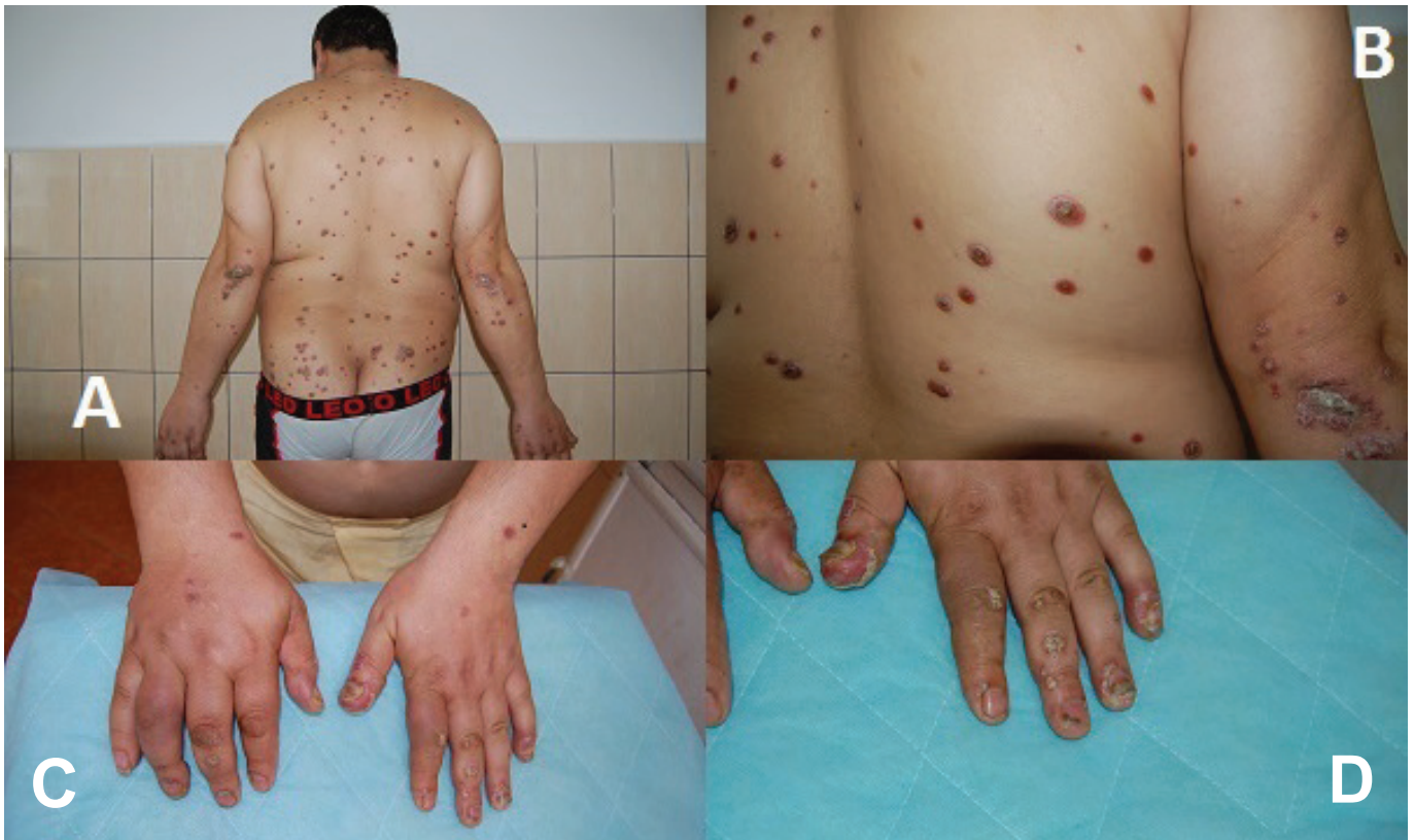
Fig. 1. Clinical aspects. A) Disseminated eruption of rupoid crusts B) Rupoid crust – detail C) Dactylitis D) Onycholysis