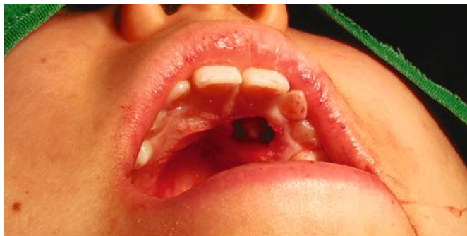
Fig. 3. Palatal inclusion (gingivectomy)

around the buccally impacted and realigned canines was very severe, two of these patients exhibiting an average gingival index of 3, with advanced inflammation, congestion, stasis and spontaneous bleeding.