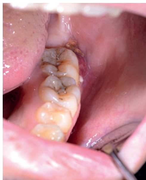
Fig. 1. Intraoral image showing exposed necrotic bone, redness and suppuration in the area of previously extracted mandibular left wisdom tooth

We first treated the exposed necrotic bone and the extraction wound conservatively for 5 weeks. On the second stage we performed sequestrectomy as soon as the necrotic bone was demarcated. Long term follow-up revealed no recurrence of ONJ and satisfactory postoperative results. The patient still visits our clinic every 3 months.