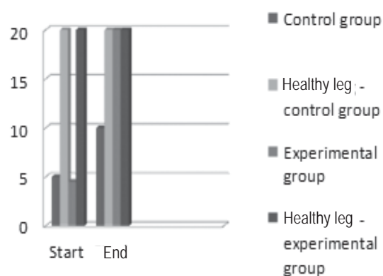
Fig. 1. Outcomes on dorsal flexion in the ankle joint (control and experimental groups)

With standard Manual Muscle Testing there were measured the basic muscle groups, which provide the movement of ankle joint in sagittal plane. Essential differences were reported in strength of the plantar and dorsal flexor muscle groups in patients, including in experimental group. The results are shown in Table 3. The representative outcomes are in percentages (%) and with P-Value: 0.000.